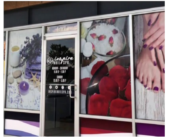
Excessive window coverage that reduces active frontages will generally not be permitted.