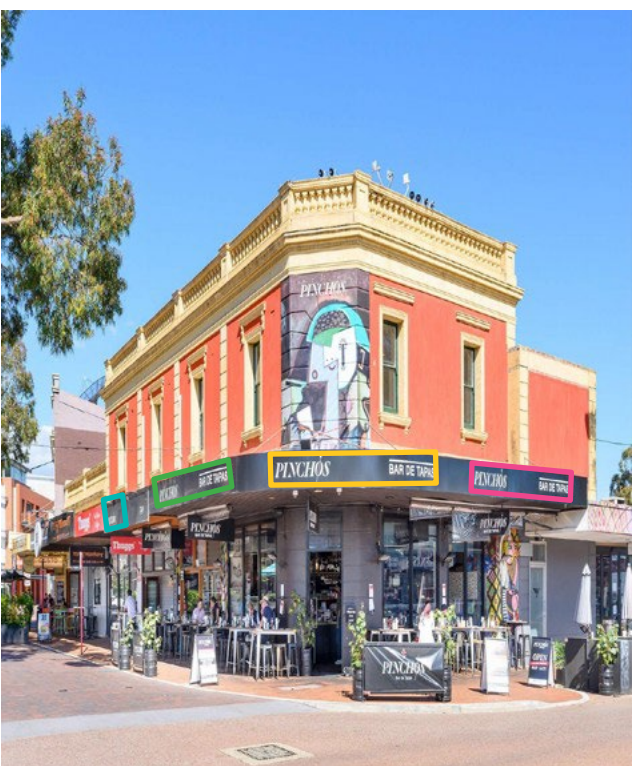
Awning fascia sign calculation