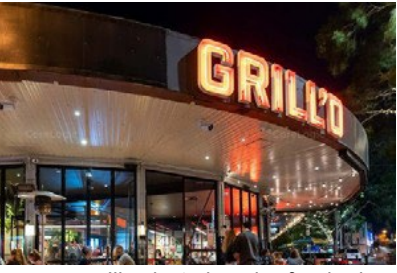
Illuminated awning fascia sign