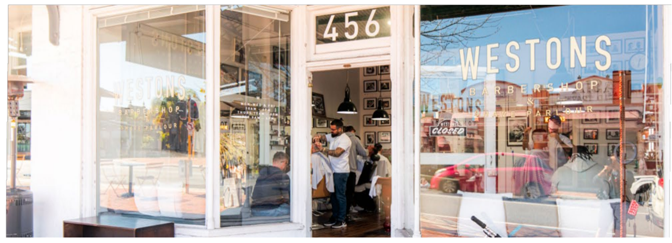
Advertising signs should maintain active frontages and visual surveillance into and out of the business.