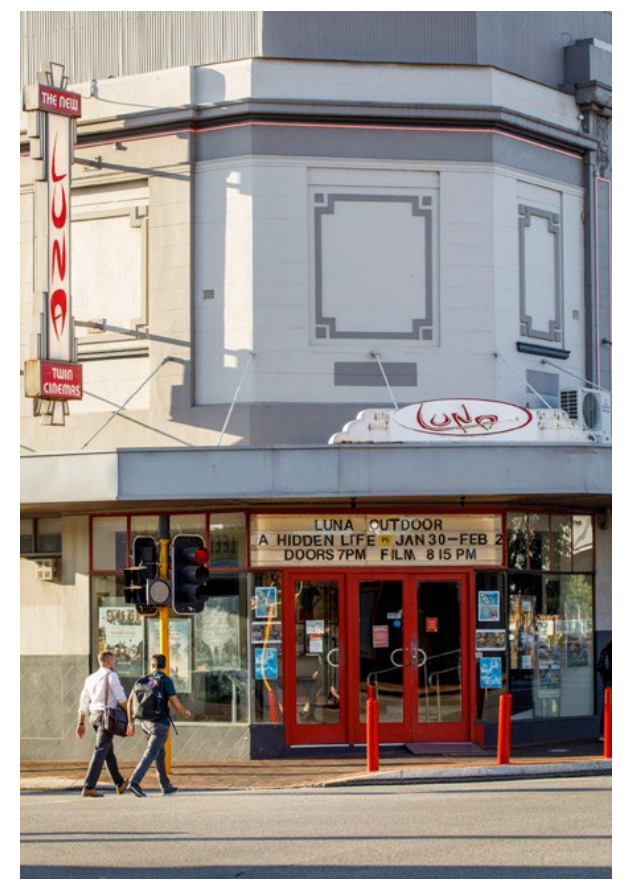
Signage does not detract from or obscure the significant elements of the heritage place.