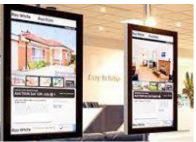
Digital window sign