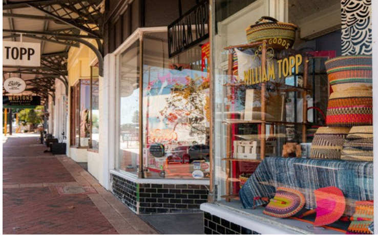
Windows free of excessive signage maintains active frontages and visual surveillance.

of the aggregate of a tenancy's ground and first floor level windows which are visible from the street or a public area, whichever is the lesser.