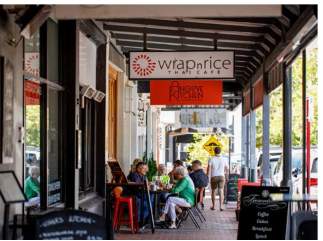
Consistency of signage location and scale provides continuity to the streetscape at pedestrian level.