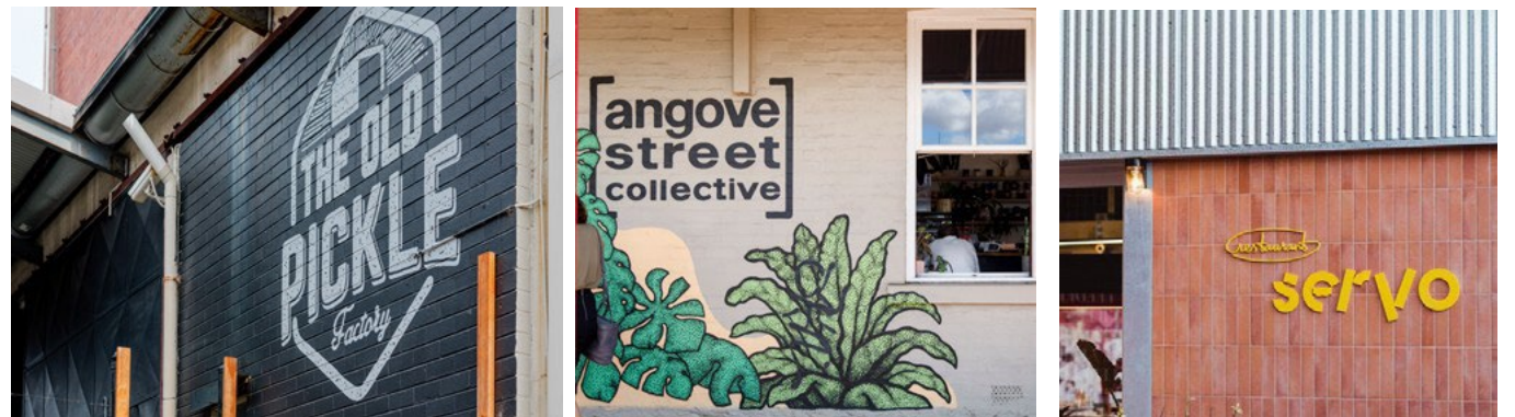
Wall signs can add visual interest when creatively designed or incorporated into the design of the building.