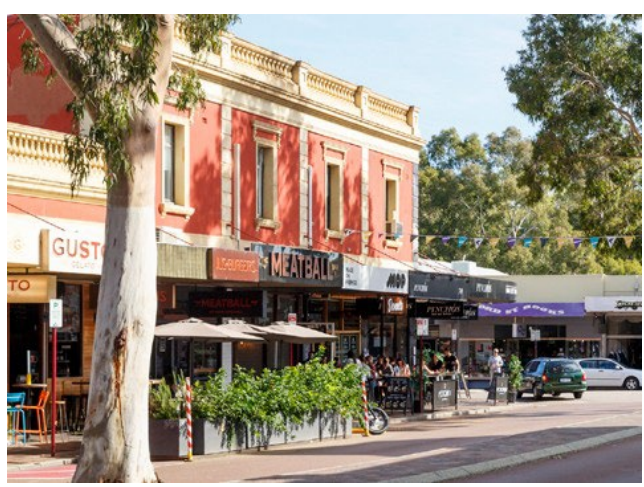
Acknowledging the local context produces a uniform and consistent series of advertising sign opportunities.