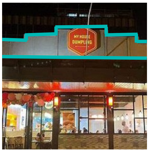
Roof signs are incorporated into the roof design of the building on which they are attached.