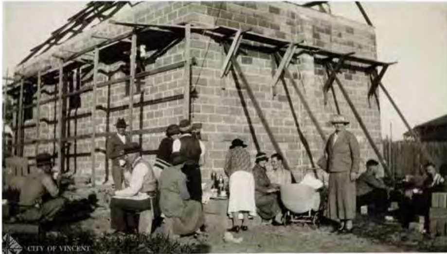
Building the Church, 1937. City of Vincent image 1012921