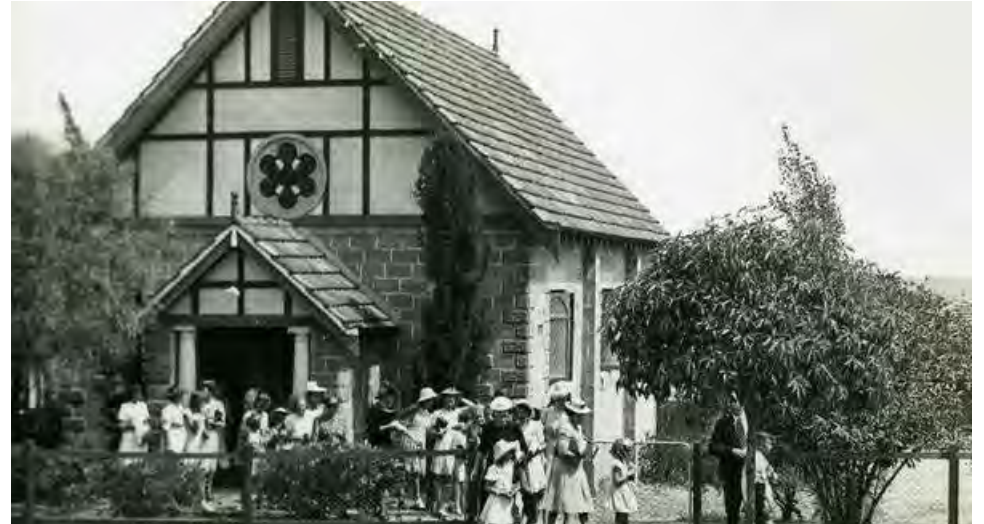
Presbyterian Church, c1940.