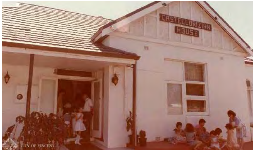
Castellorizian House, 10 December 1981. Courtesy City of Vincent Local History Collection, image 1053051.