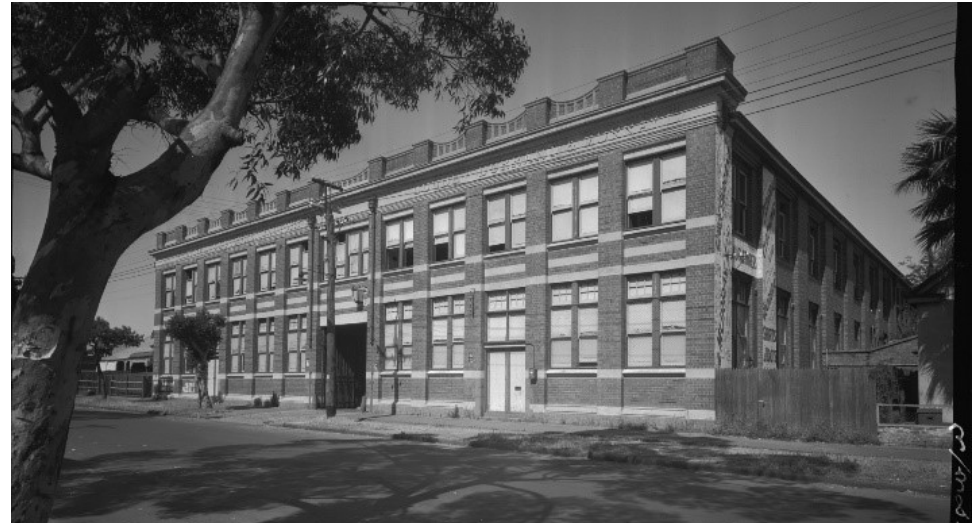
Goode Durrant 1907 SLWA image b5968932_4