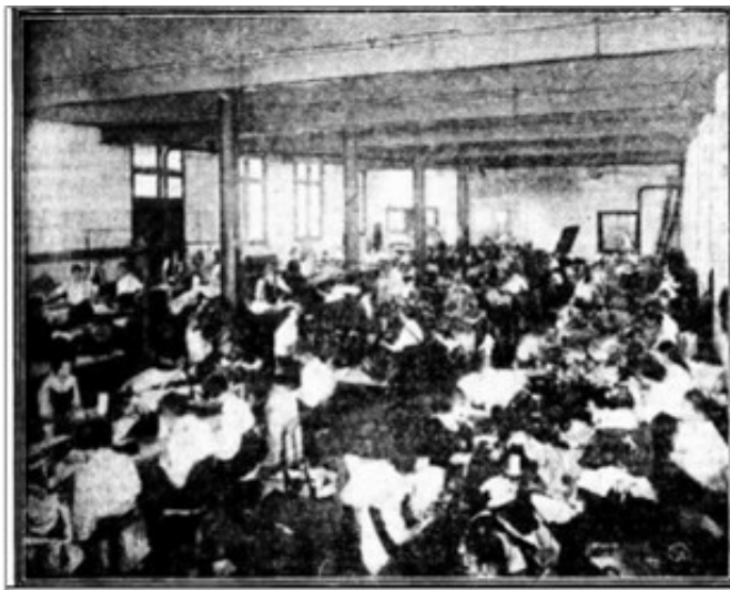
WORKROOM AT GOODE, DURRANT'S CLOTHING FACTORY, PALMERSTON STREET, PERTH.