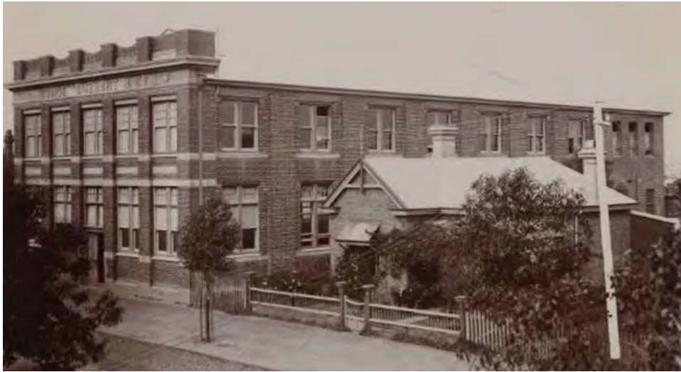
Goode Durrant 1907 SLWA image b5968932_4