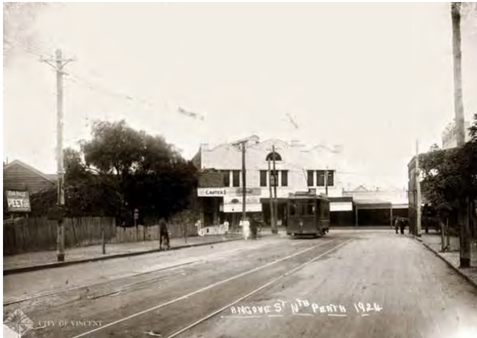
View to Rosemount Theatre, 1924. Courtesy City of Vincent Local History Collection, image 1033671.