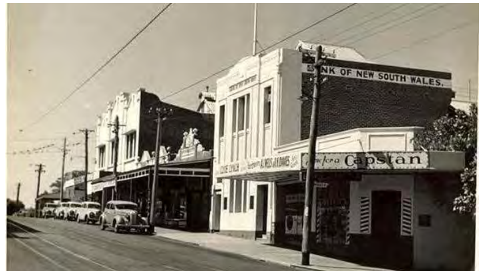
View of Fitzgerald Street, 1940s. Courtesy City of Vincent Local History Collection, image 1016941.