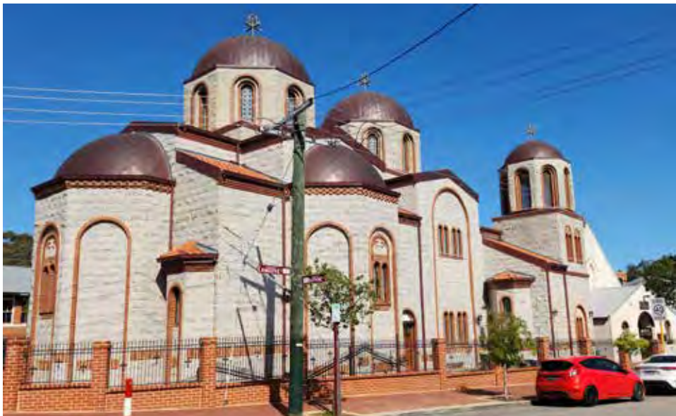
St Nikola Macedonian Orthodox Church