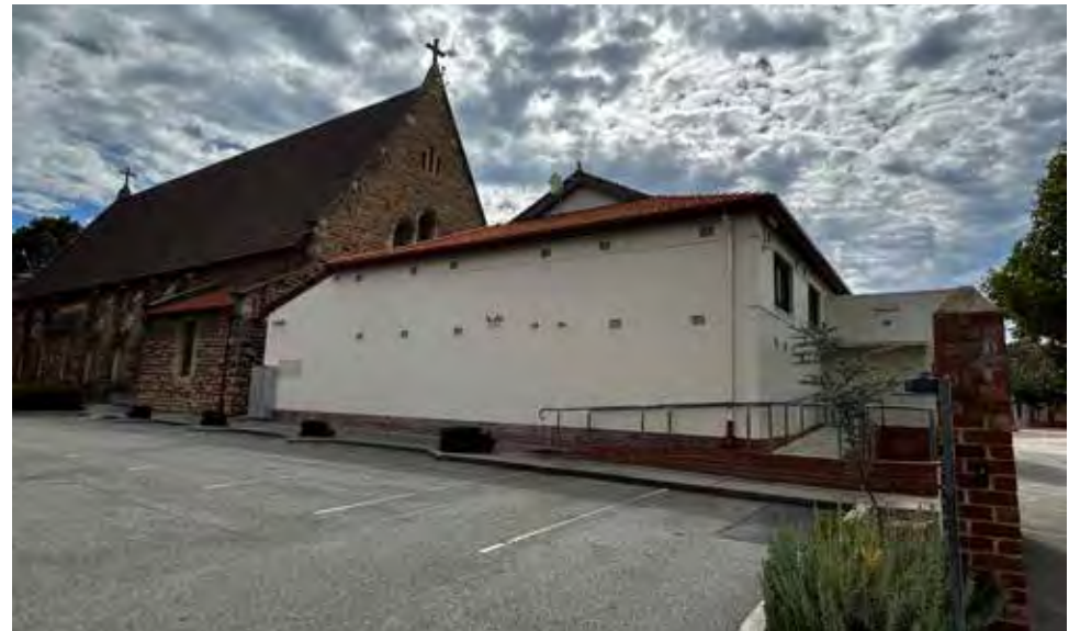
Sacred Heart Church Hall