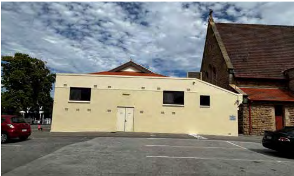
Sacred Heart Church Hall