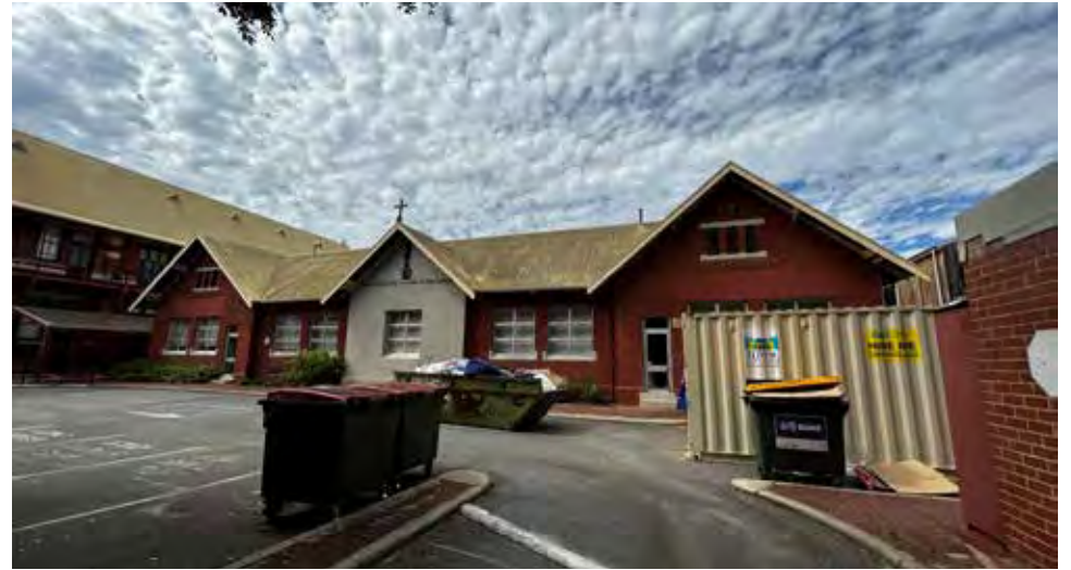
Sacred Heart Primary School