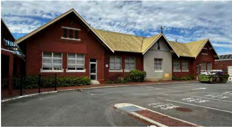
Sacred Heart Primary School