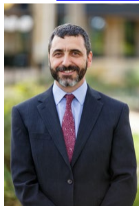
DIRECTOR - INFRASTRUCTURE & ENVIRONMENT