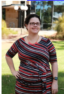
DIRECTOR - COMMUNITY & BUSINESS SERVICES