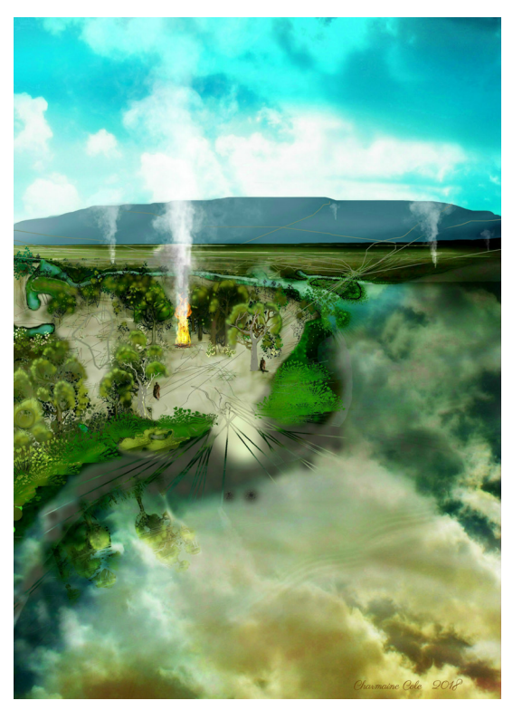
Artwork by Charmaine Cole

A Smoking Ceremony is a significant ceremony and should only be performed with permission from the Traditional Owners.