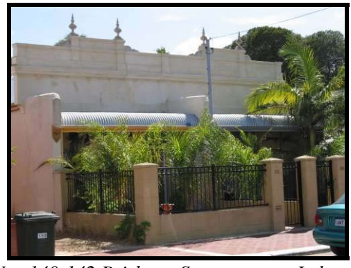
Nos.140-142 Brisbane Street, corner Lake Street, Perth