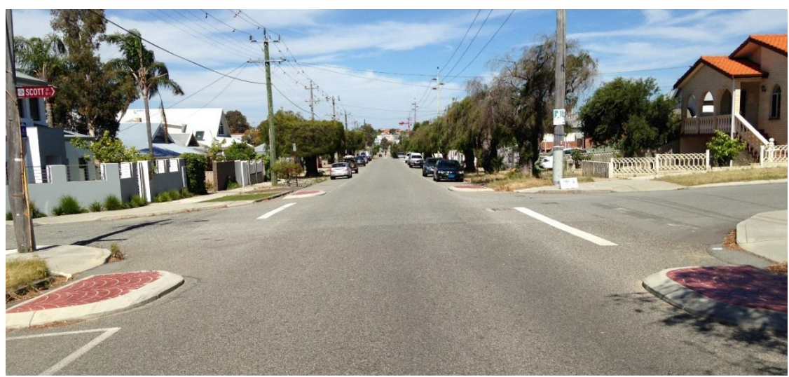
Bourke Street - looking east from Scott Street

Bourke Street, between Loftus Street and Oxford Street, links a District Distributor A Road Loftus Street, controlled by traffic signals, with a District Distributor B Road, Oxford Street, controlled by a roundabout. It currently carries in the order of 2,503 to 3,544 vehicles average weekday traffic (AWT) with the traffic volumes varying by block.