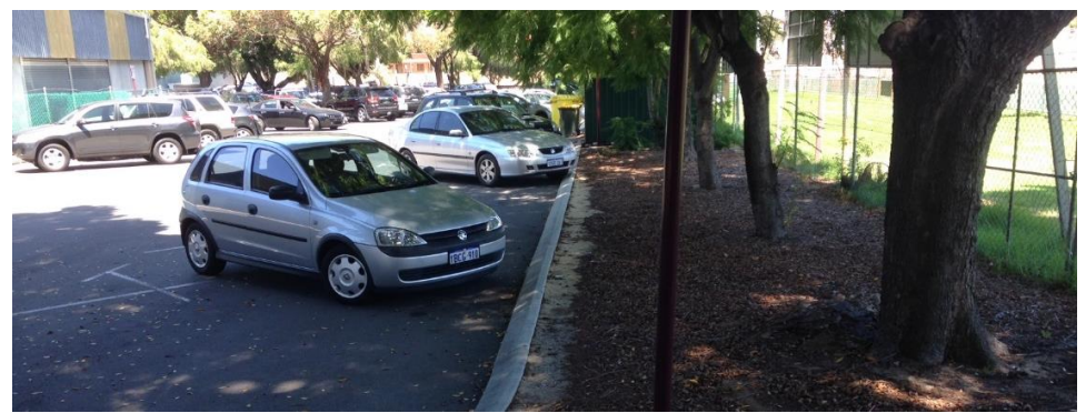
Western side of the carpark - 1.20m widening required

The widening would allow for 90 degree parking at this location, without affecting the existing trees, and would increase the number of bays (with some additional bays adjacent to the southern side of the bocce club) from seventeen (17) to thirty-one (31) resulting in 134 bays overall.