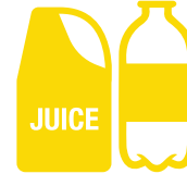
Plastic bottles and containers