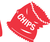
Soft plastics (or take to REDcycle bin)