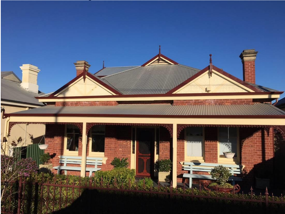
Front Elevation – No. 3 Mignonette Street, North Perth