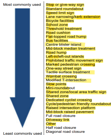
Figure 7.1: LATM devices commonly used by local governments