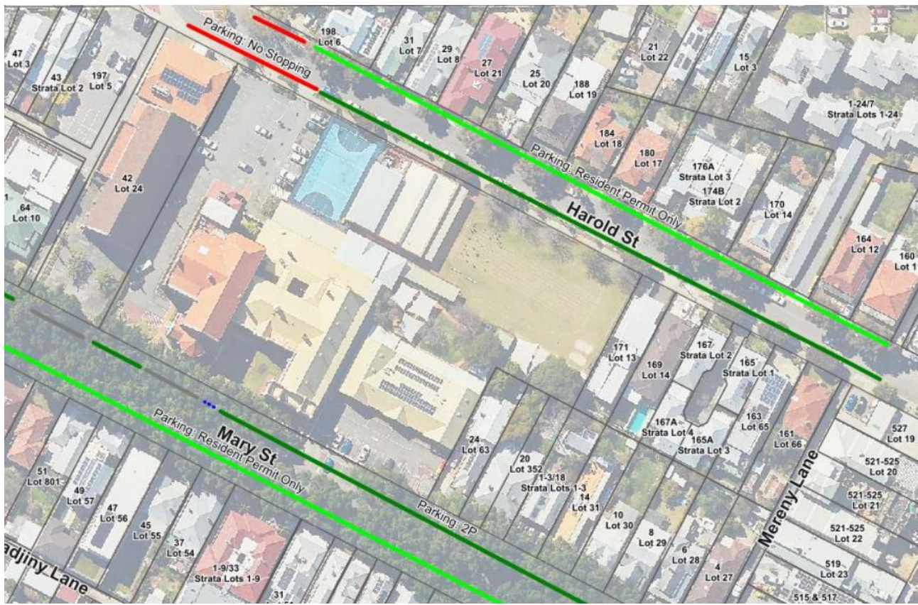
Proposed Parking - Harold Street