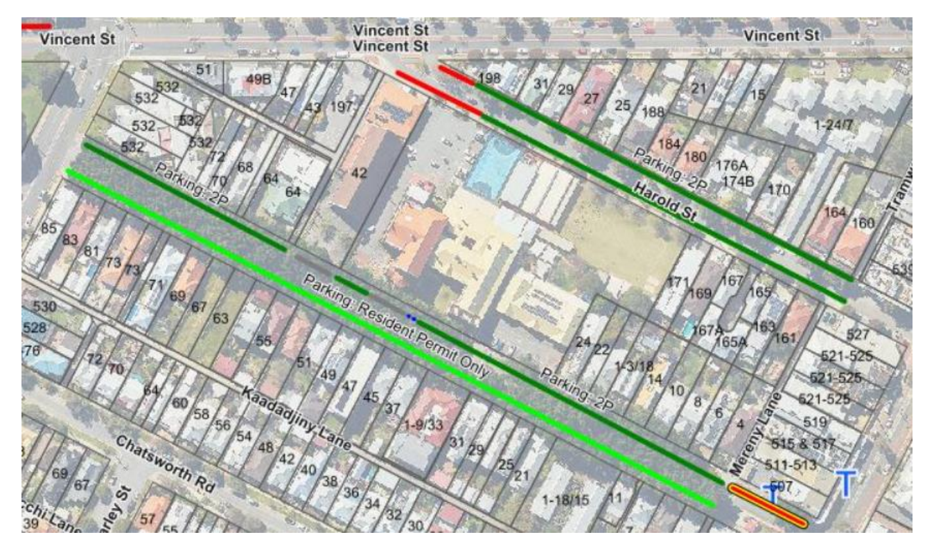
Current Parking - Harold Street and Mary Street

The current parking restrictions on Harold Street are 2P at all times on both the northern and southern side. Mary Street currently has 2P, 9PM – 6PM, Monday to Friday parking restriction on the northern side, and resident only parking on the southern side.