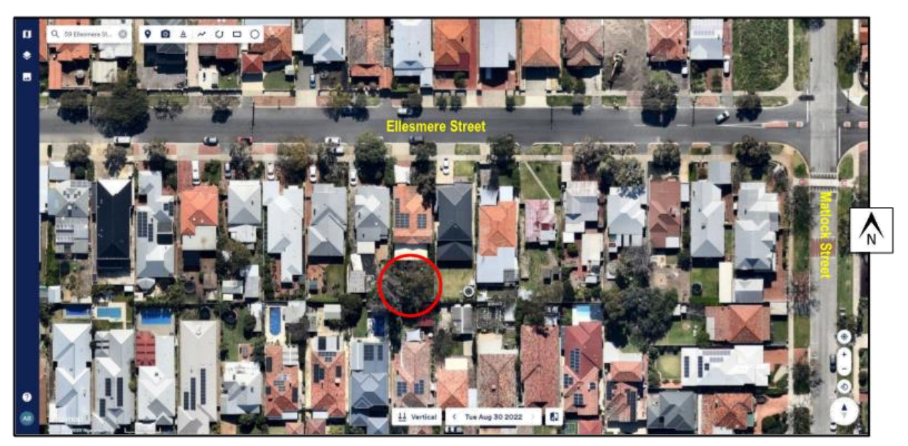
Figure 1. Tree of assessment outlined in red - image date 30th August 2022

To inspect the subject tree as specified by Shelley Blechynden, to provide comment on current health and structural status of the tree for inclusion into City of Vincents Trees of Significance Register and; identify management considerations required for the retention of the tree at 59 Ellesmere Street, Mount Hawthorn (circled in Figure 1).