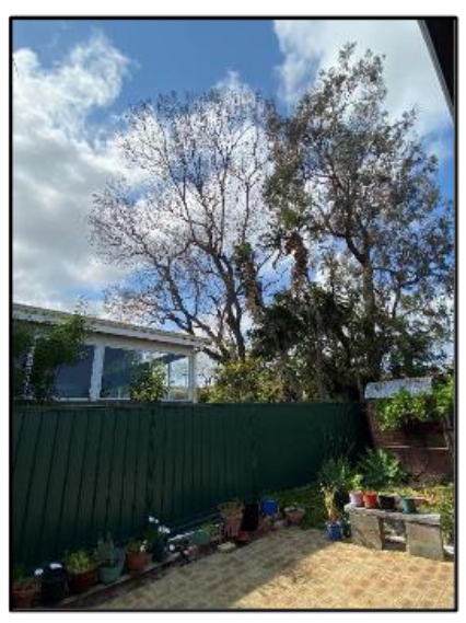
Figure 2 - Subject tree at the time of inspection (20 October 2022) Image looking South

Refer Appendix A & B for further detail regarding VTA Results and Site Images.