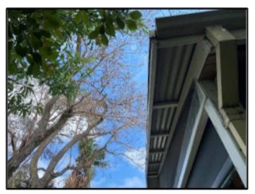
facing West – showing failed stem caught in canopy