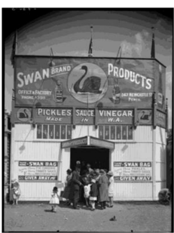
Display at the Perth Royal Show

Considering the very large size of the tree and the possibility it was in existence in 1942 as determined from early aerial maps, together with the knowledge that Jacaranda trees were very popular at the time, it is possible the tree is 90