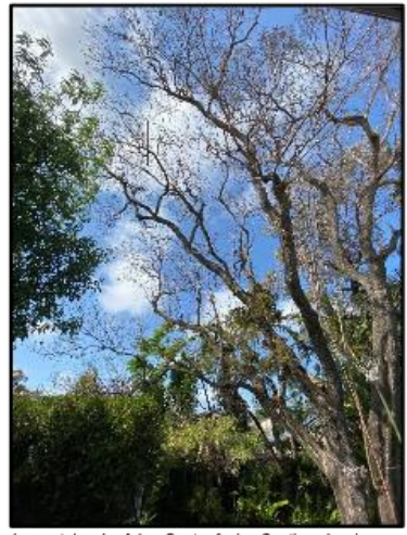
Image taken by Arbor Centre facing South – showing canopy heading toward eastern neighbour