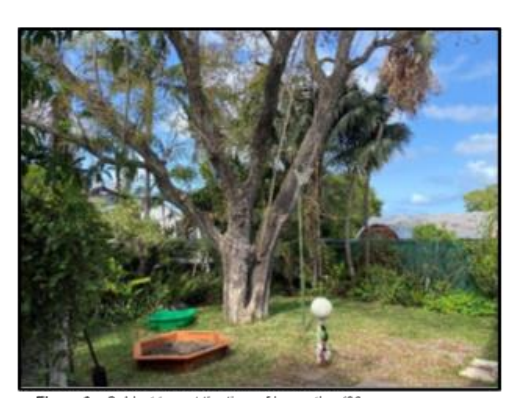
Figure 3 – Subject tree at the time of inspection (20 October 2022) Image looking South-West

The subject tree – Jacaranda mimosifolia (Jacaranda) was assessed on the 20<sup>th</sup> of October 2022. Minor structural defects were noted within the canopy; however, these flaws/defects are considered to be manageable given the appropriate arboricultural practises are applied moving forward - refer figures 2, 3 & 4 for detail.