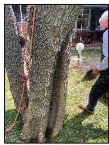
facing North – showing fluting at ground level