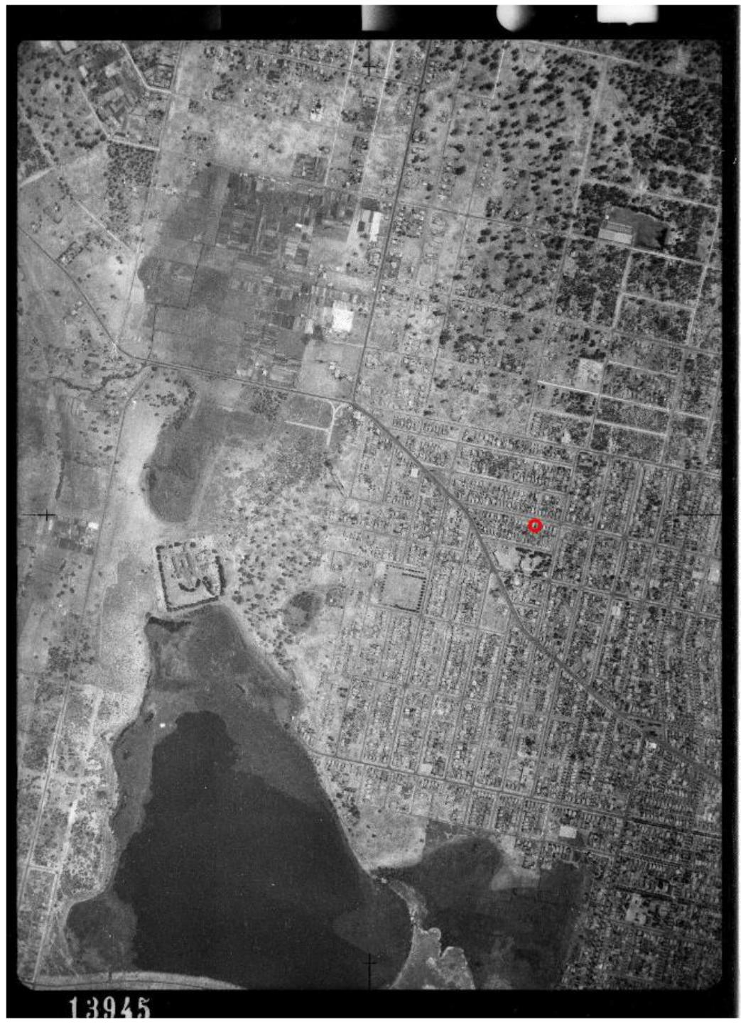
Appendix E: Historical Data – Aerial Imagery from 1942

Prepared for: Shelley Blechynden 59 Ellesmere Street, Mount Hawthorn Visual Tree Assessment (VTA) – October 2022