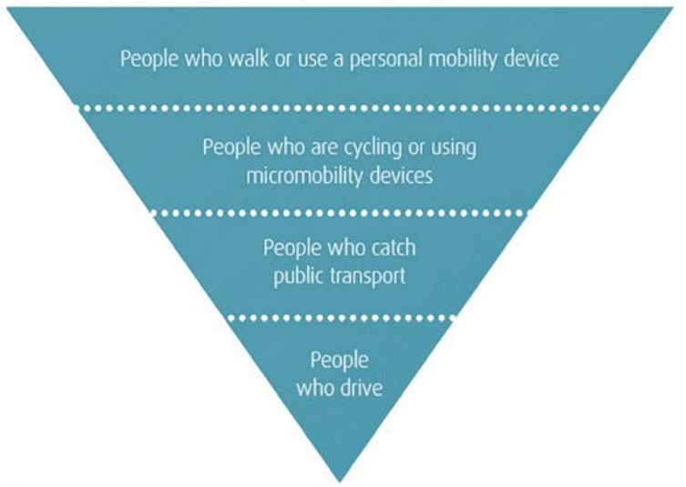
(Figure 1: ACS User Hierarchy Model)

The Accessible City Strategy (ACS) was adopted by Council on 18 May 2021. The development of the ACS was guided by the Strategic Community Plan (SCP). Through this, the Vincent community identified a preference to prioritise pedestrians and better connections with cycling and public transport facilities. This is demonstrated in the ACS User Hierarchy Model (Figure 1).