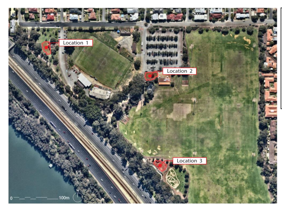
Location 1: (Revised location Proposed) Northwest corner of Britannia Reserve

Location 2: Adjacent the central sporting clubroom and playground