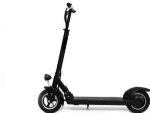
Figure 1: Illustration of a typical e-scooter

E-scooters are also available to purchase for private use across Australia. Suppliers sell e-scooters with a disclaimer for users to consult the relevant legislation regarding operation.