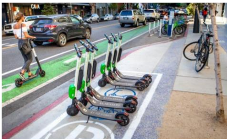
Figure 4. Designated e-scooter parking zone.