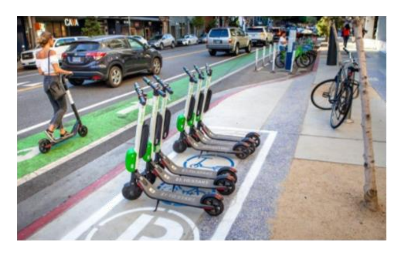
Figure 4. Designated e-scooter parking zone.