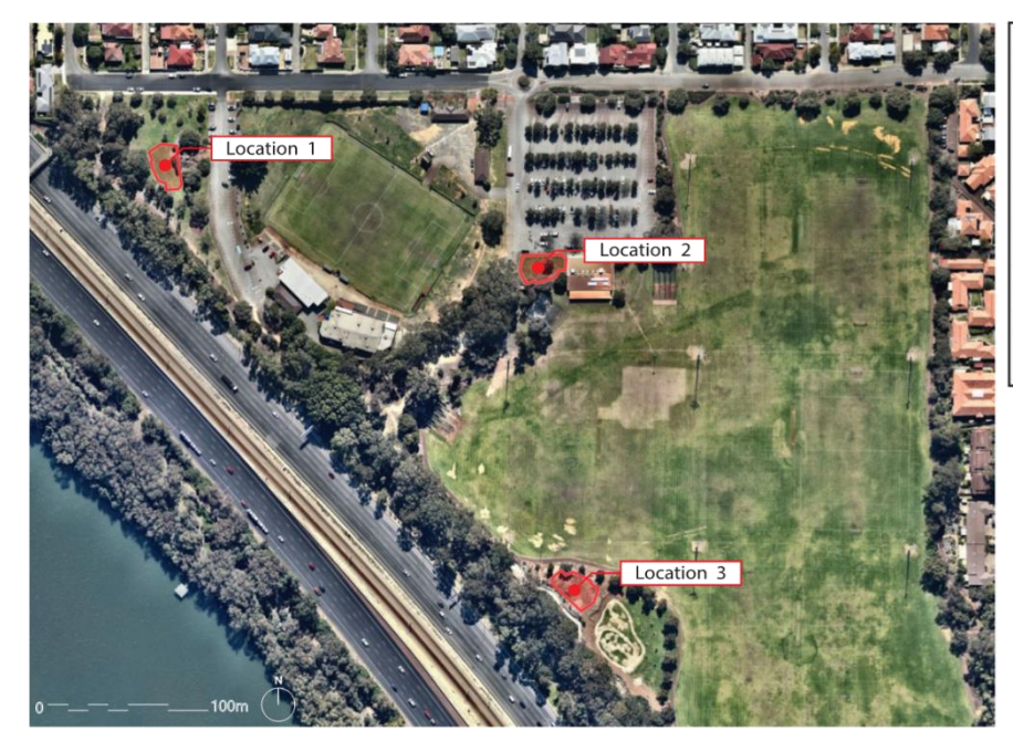
Location 1: (Revised location Proposed) Northwest corner of Britannia Reserve