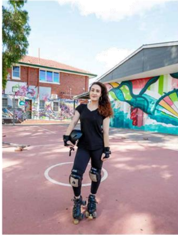
6 | City of Vincent