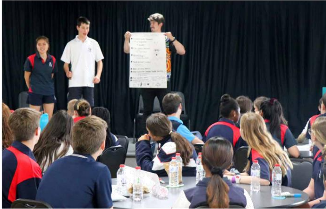
16 | City of Vincent