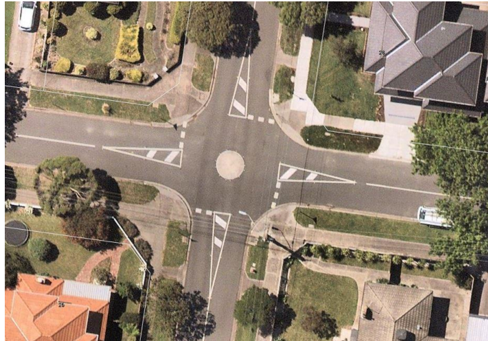
A typical mini roundabout as installed by the City of Monash in Monash, Metropolitan Melbourne, Victoria