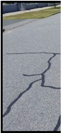
An interim crack sealing, - pi (Fleet St – Access Road)

An asset sustainability ratio indicates whether assets are being kept up-to-date, or if they are generally degrading over time.