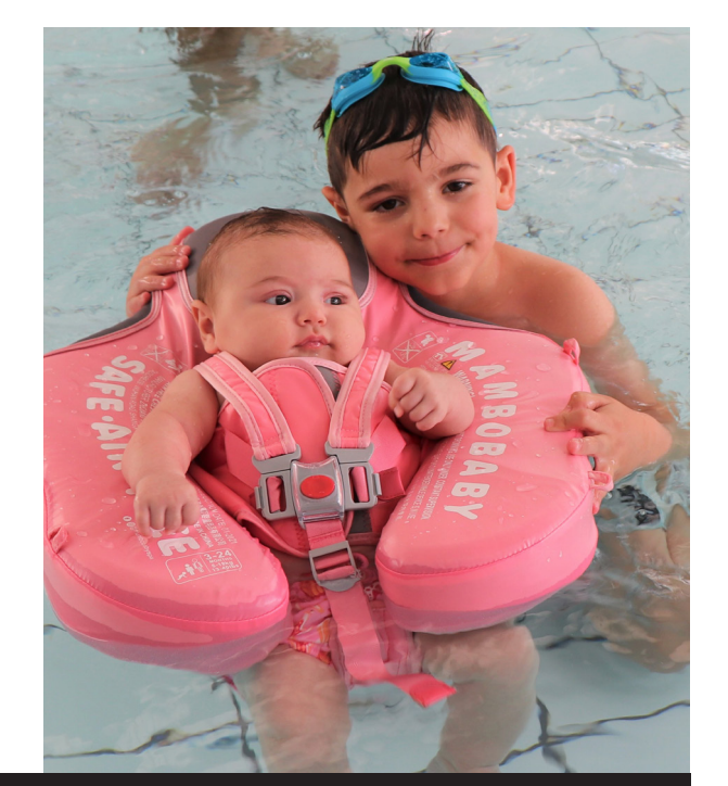
A young smiling boy poses with his infant sister in the children's pool at Beatty Park. The infant is in a pink flotation device

Outcome Eight – People with disability have the same opportunities as other people to have their needs and entitlements considered when the City of Vincent is developing and implementing policies and procedures.