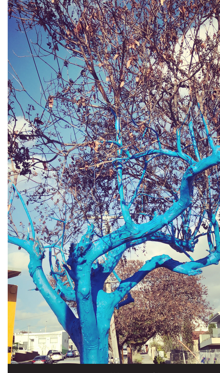
A tree on a Vincent verge painted blue as part of the Blue Tree Project to raise awareness of mental health and wellbeing.

Update staff and contractor induction and on-boarding to increase awareness of this plan and how it relates to individual work areas.