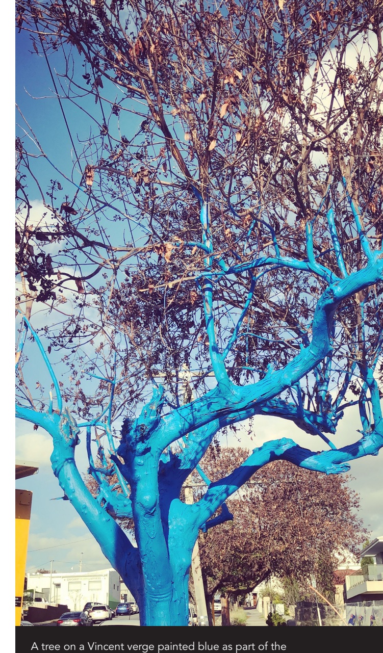
Blue Tree Project to raise awareness of mental health and wellbeing.

Update staff and contractor induction and on-boarding to increase awareness of this plan and how it relates to individual work areas.