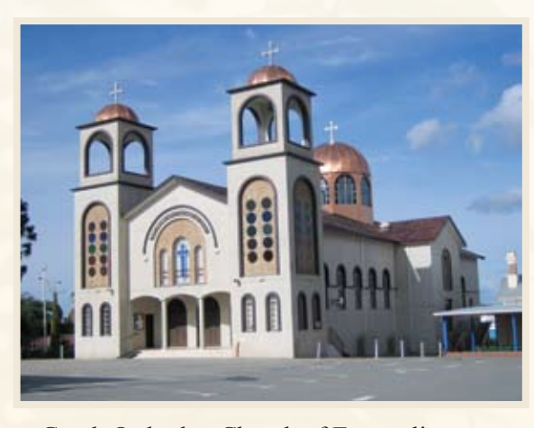
Greek Orthodox Church of Evangelismos 59 Carr Street