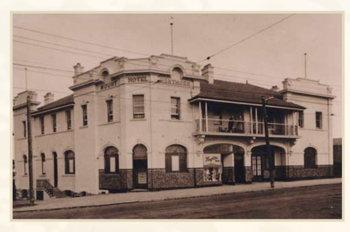
The Mount Hawthorn Hotel 1940s