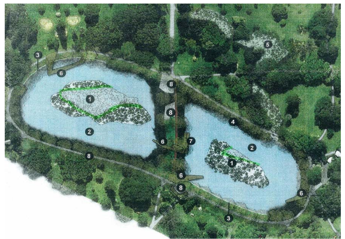
Plan of Syrinx Option 2: The "Ornamental" Permanent Water Solution:

Based on the desired water level in the Lakes, the supplementary water volume will have to be determined. It is expected that the necessary volume would be approximately 20ML to 25ML per annum.