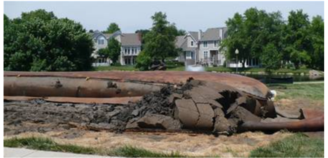
Envirotubes being cut open to enable the dry material to be removed.

Based on a reduced Lake area of approximately 18,000m^2 if an average of 400mm of material was removed, this would equate to a volume of 7,200m^3 (solid measure). If some of this material were to be reused as backfill behind the proposed walls (as previously estimated 3,500m3), only about 3,700m3 would be required to be removed off site.