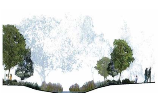
SECTION THROUGH SWALE Sectional view through proposed swale