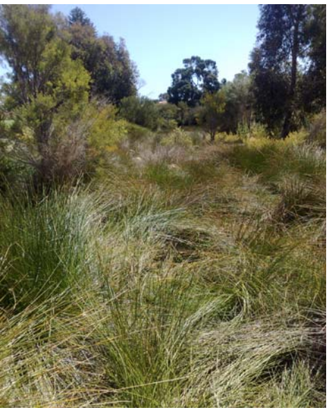
Example of vegetated swale

Alternatively it was outlined during meetings of the HPLRWG that a new bore to top up the Lakes could be investigated and possibly constructed along the northern side of Hyde Park should preliminary results indicate a better groundwater quality.