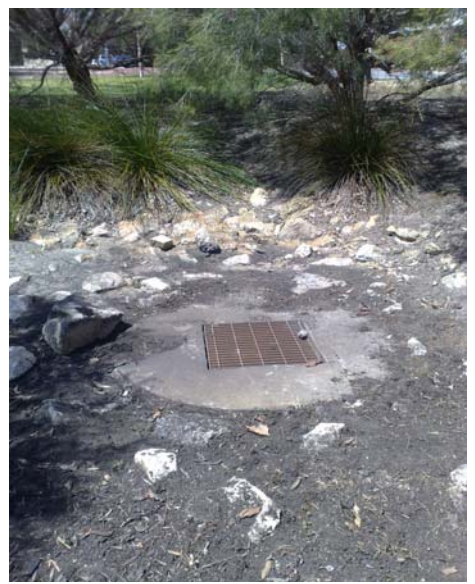
Bubble-up outlet for bore

In addition, whilst treatment of the bore water prior to entering the Lakes was not discussed in any great detail in the Syrinx Report, it is envisaged that if the existing groundwater bore was utilised (Bore No. 29, located in the south eastern corner of Hyde Park) it may be possible to create another smaller treatment swale (refer following photos) in this area, meandering between the existing wall and the proposed Lake wall.