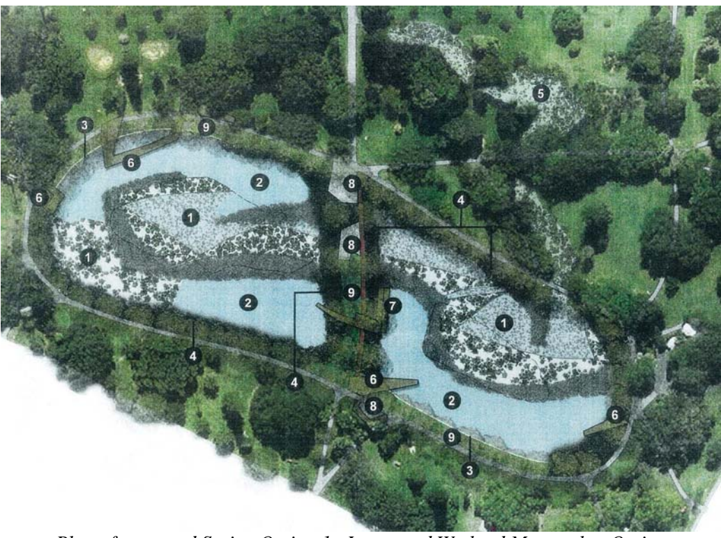
Plan of proposed Syrinx Option 1- Integrated Wetland Masterplan Option