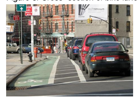
Figure 4. Example of bike lane protected by parked cars (painted in this case)

Figure 3. Cross- section of bike lane protected by parked cars