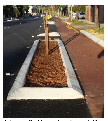
Figure 2. Sample view of Scarborough Beach Road separated bike lanes

Option 1. Protected bike lanes on both sides of Bulwer Street, between William and Beaufort Streets with a loss of 35 parking spaces (refer attached Plans No.s 3193-CP-03, 04 and 05 Attachment 3 ).