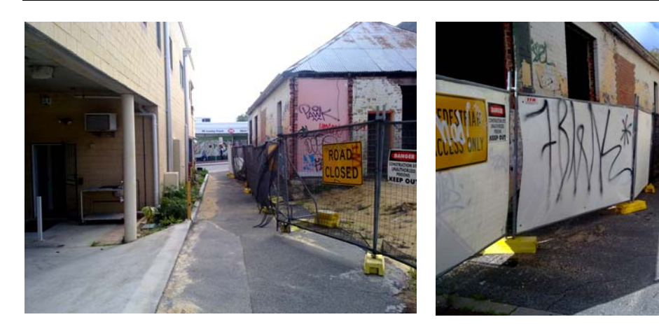
ROW leg looking towards Beaufort St