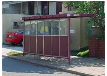
JSc style shelter