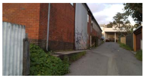
ROW: Looking East to the development site (left) and adjacent ROW

The surface of ROW is in very good condition, with some minor patching having been undertaken where required. The City has a significant piped drainage system which goes across the ROW at the low point, carrying storm water through to Britannia Road and eventually, Lake Monger. Additional collection points can be installed in the ROW if deemed necessary, however to date there has been no requirement.