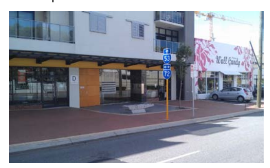
378 Beaufort Street

With the recent completion of the Civic Rise Development the building was set-back in accordance with the Metropolitan Region Scheme (MRS) road widening requirements. The area shown in the photograph below (to the left of Wall Candy) is the location of the proposed bus stop.