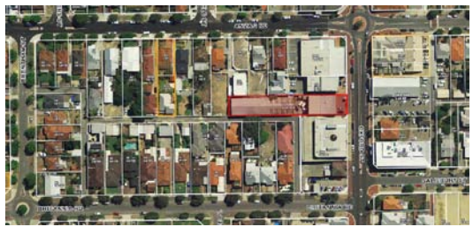
The proposed development – (red boarder)

Further, orderly on-site parking provision for the development will be an improvement of the current circumstances, where vehicles associated with the car maintenance business are frequently parked in the ROW.