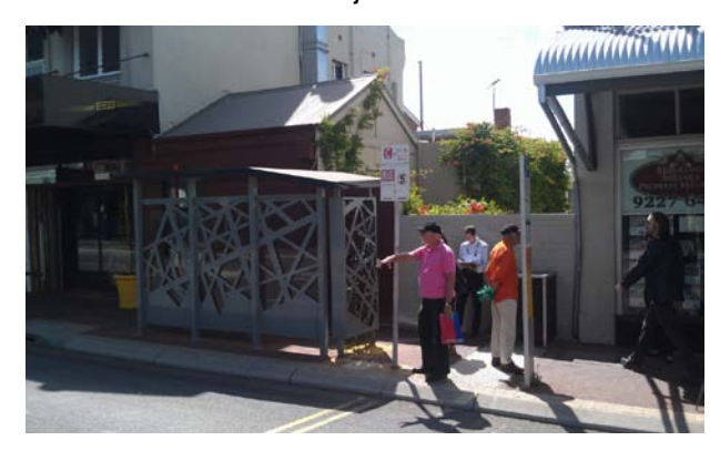
Shelter to be relocated (near Broome Street)

Therefore it is proposed to install the shelter on the western side of Beaufort Street before Chatsworth Road and adjacent 467/469 as shown on the second photograph below.