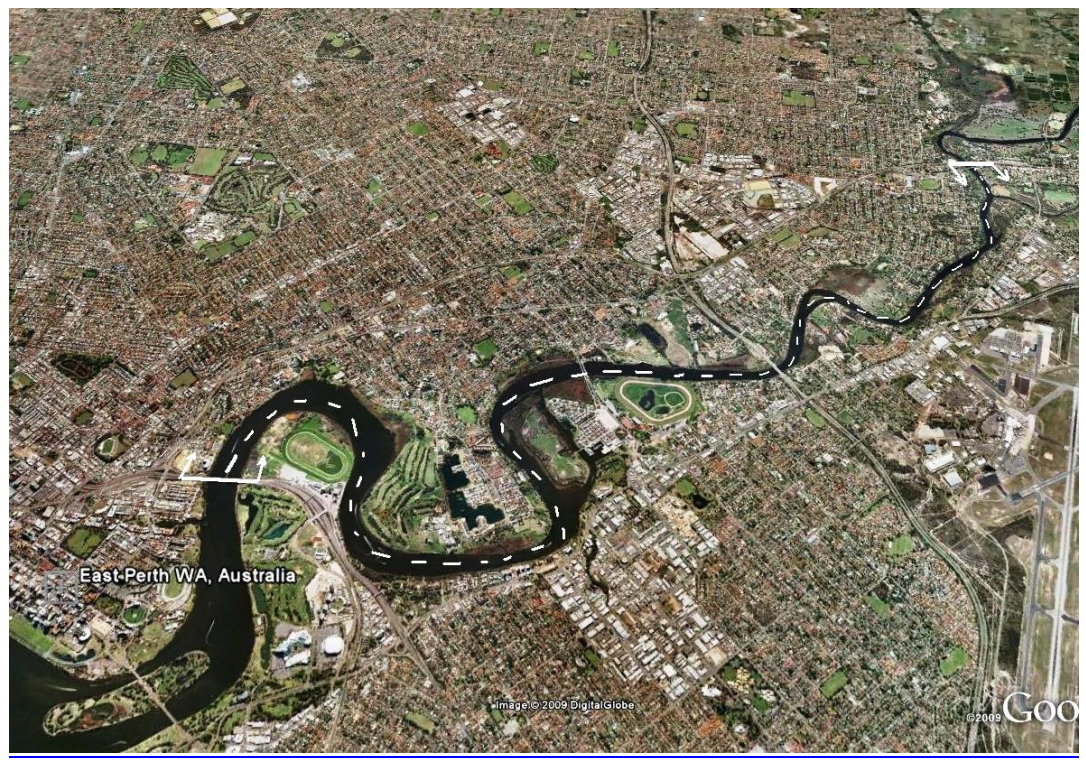
<u>Photo 1</u>: Aerial Photograph of Swan River (dashed) between the Windan Bridge (in East Perth) and the Guildford Road Bridge (in Guildford)

The project is a direct follow up to the actions recommended in the 2007 Swan and Helena River Management Framework which provided a strategic framework to guide the ongoing management and development of the eastern reaches of the Swan River and its major tributary, the Helena River.