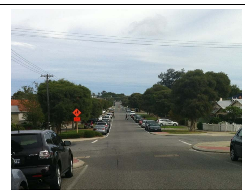
Hobart Street, Looking west – The proposed central planted median will provide separation of traffic, central refuge, opportunity for beautification (trees) and protected embayed parking.