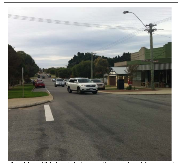
Auckland/Hobart Intersection – Looking east along Hobart Street.

The wide intersection of Hobart/Auckland (as shown in the photo below) will be better defined and delineated to better channel traffic while providing pedestrian refuge while vehicle speed in Hobart Street will be better regulated by the raised plateau.