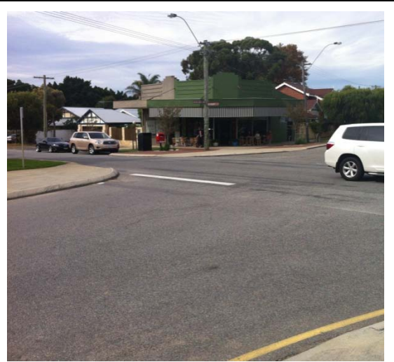
Auckland/Hobart Intersection – Looking south along Auckland Street.