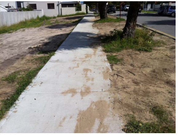
Vehicles parking on the verge and accessing the vacant block across the footpath are creating a slip hazard.