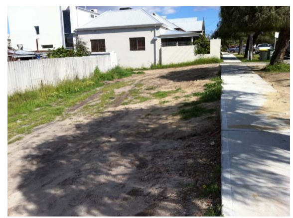
There is a severe drop from the back of the footpath to the vacant block.