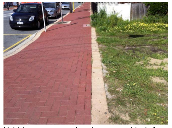
Vehicles are accessing the vacant block from Beaufort Street causing damage to the brick paved footpath.