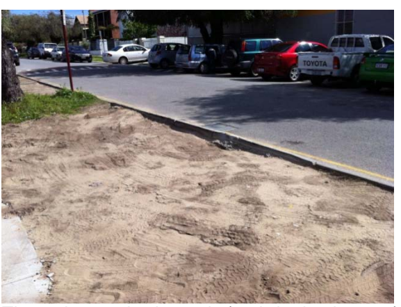
There is a trip hazard (and kerb damage) caused by vehicles continually parking on the verge.