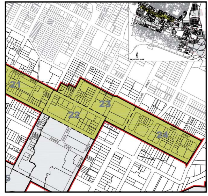
New Northbridge Project Area (Precincts 23 and 24)