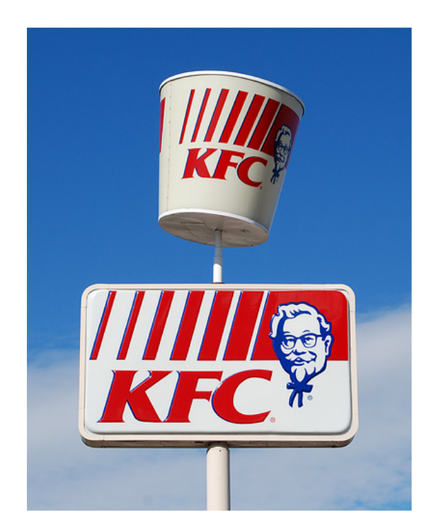
Figure 1: Example of Three-Dimensional Signage

It is considered that three-dimensional signs can be adequately assessed according to the provisions outlined in Section 2 of the Policy, and that prescriptive details relating to three-dimensional signs would not provide any benefit in assessing these sign types.