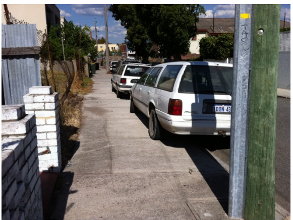
Vehicles Straddling the footpath - Brisbane Terrace (looking from west to east towards Brisbane Place)