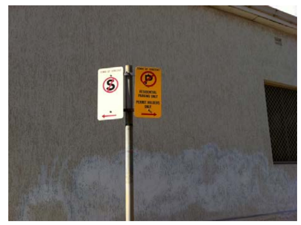
Example of existing Resident Only Parking Signage Robinson Avenue