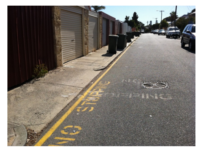
Existing 'No Stopping' line marking in front of crossovers south side of Brisbane Terrace (looking from east to west towards Lake St)