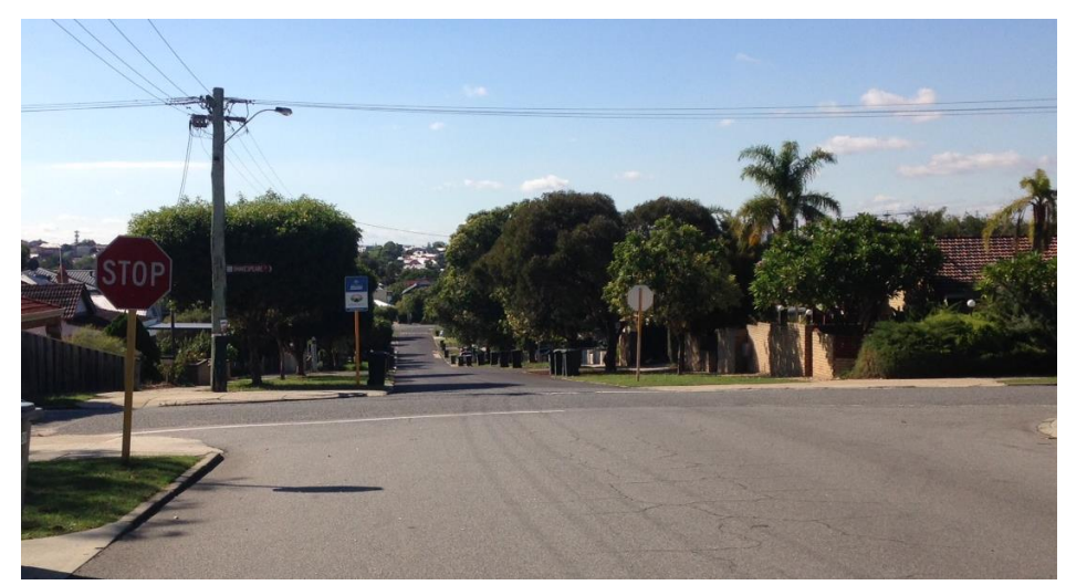
Salisbury east of Shakespeare Street 11.00am Wednesday 20 April

Very few if any vehicles are parked in the section of Salisbury Street east of Shakespeare so the introduction of the restrictions between Oxford and Shakespeare Street has had no impact on the section of Salisbury Street east of Shakespeare Street. The following photo shows no vehicles parked in the street in a normal week day.