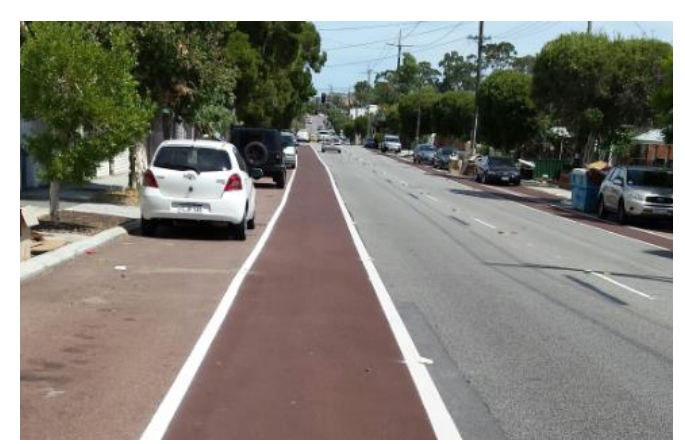
Figure 1. Sample view of existing Bulwer Street unprotected bike lane

This will comprise embayed parking at 2.1 m wide and 1.6 metre wide bike lanes (refer attached Plan Nos 3193-CP-01, 02 and 03 – Attachment 2 ).