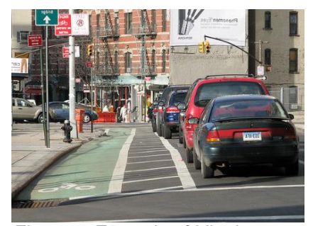
Figure 4. Example of bike lane protected by parked cars (painted in this case)