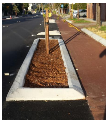
Figure 2. Sample view of Scarborough Beach Road separated bike lanes

Option 1. Protected bike lanes on both sides of Bulwer Street, between William and Beaufort Streets with a loss of 35 parking spaces (refer attached Plans No.s 3193-CP-03, 04 and 05 Attachment 3 ).