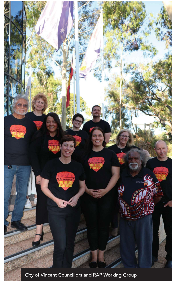
City of Vincent Councillors and RAP Working Group