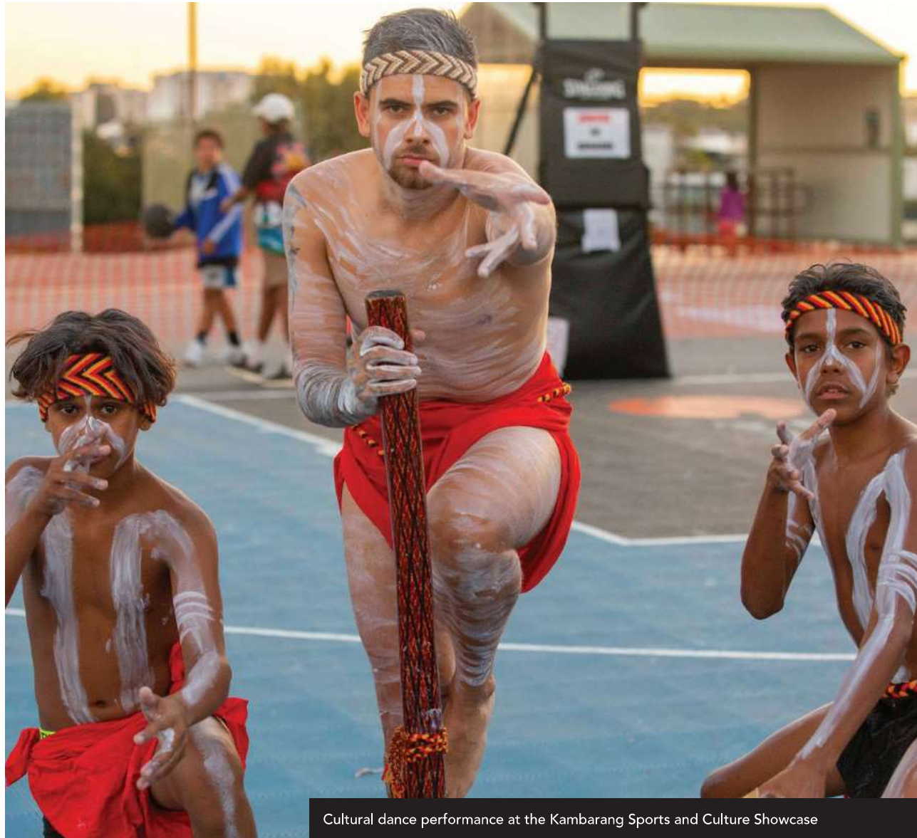
Cultural dance performance at the Kambarang Sports and Culture Showcase