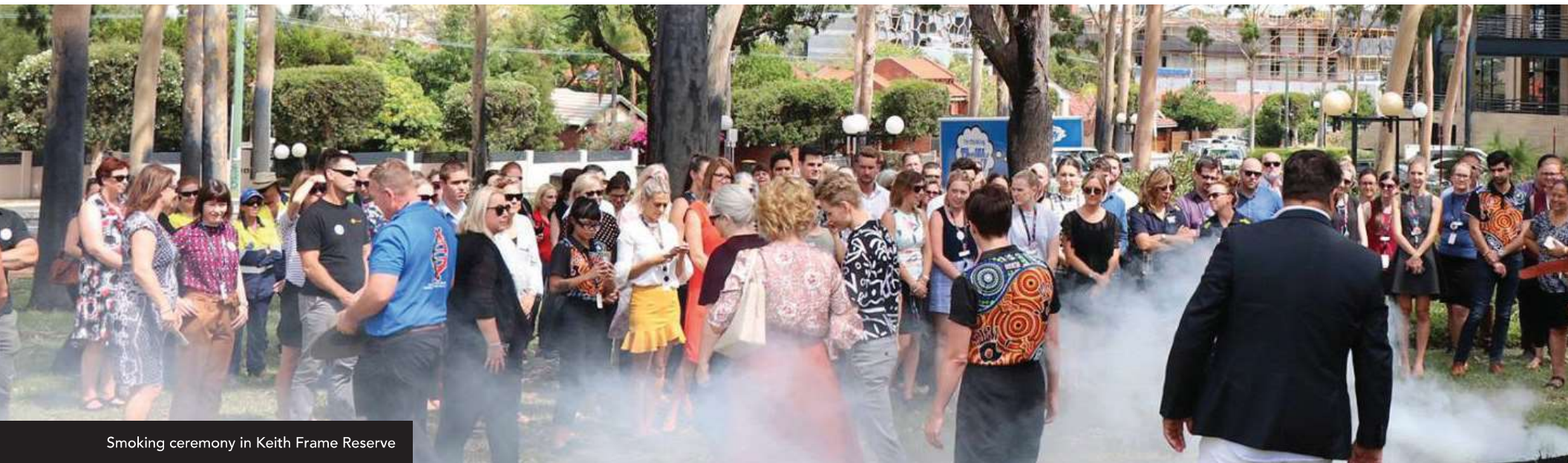
Smoking ceremony in Keith Frame Reserve