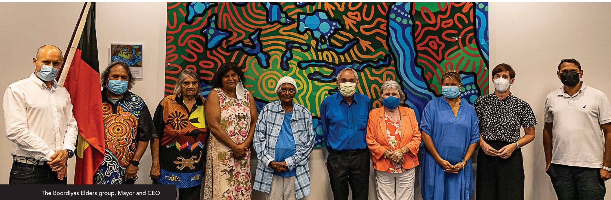
The Boordiyas Elders group, Mayor and CEO