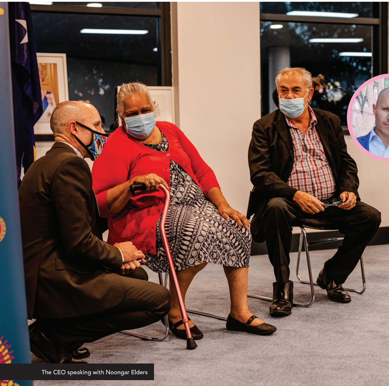
The CEO speaking with Noongar Elders