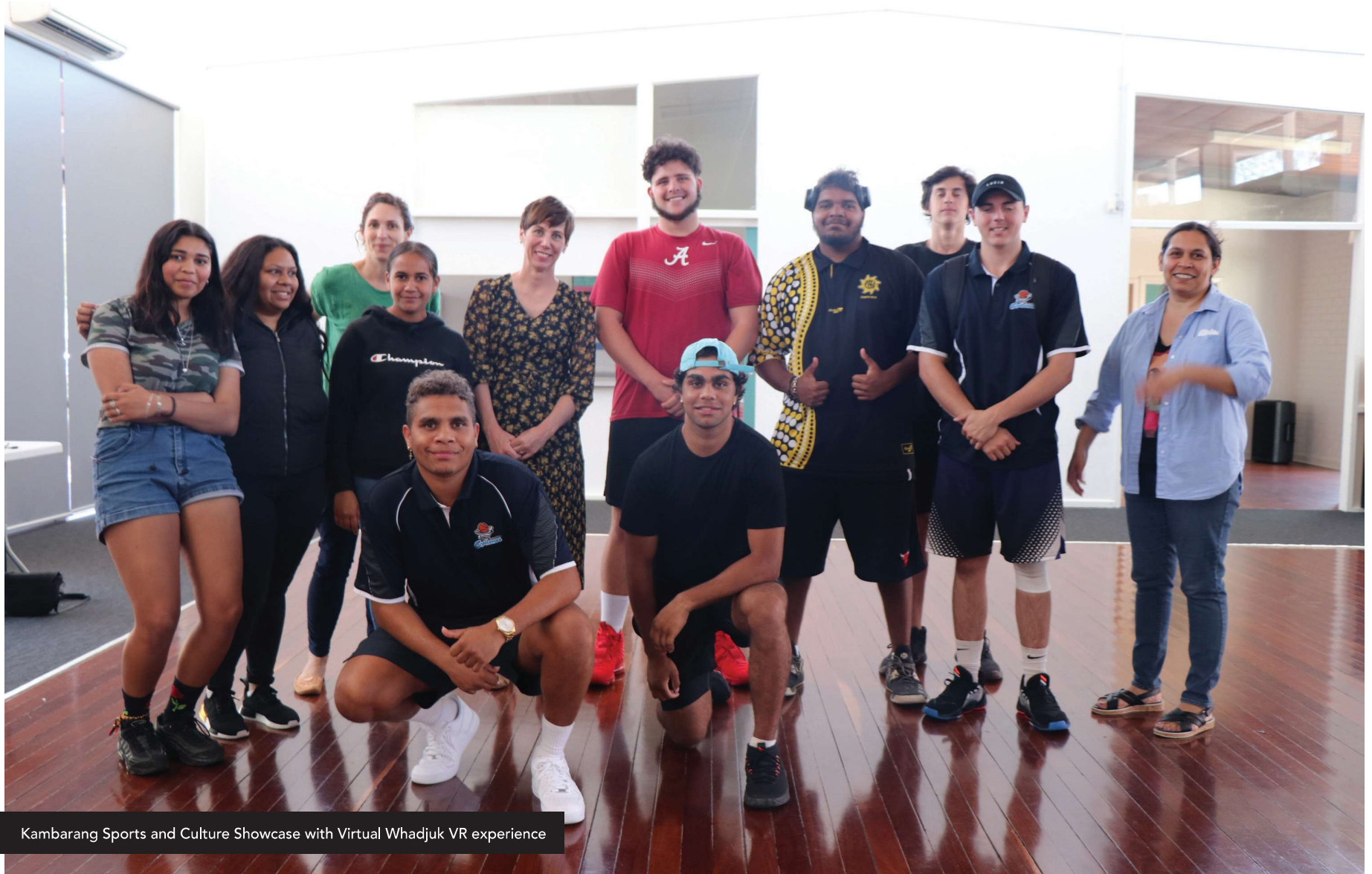
Kambarang Sports and Culture Showcase with Virtual Whadjuk VR experience