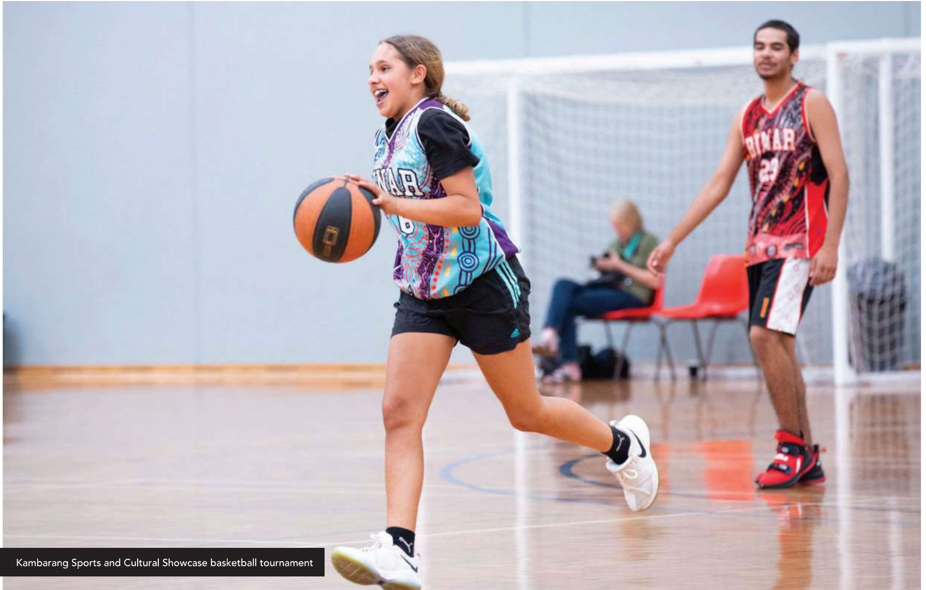
Kambarang Sports and Cultural Showcase basketball tournament