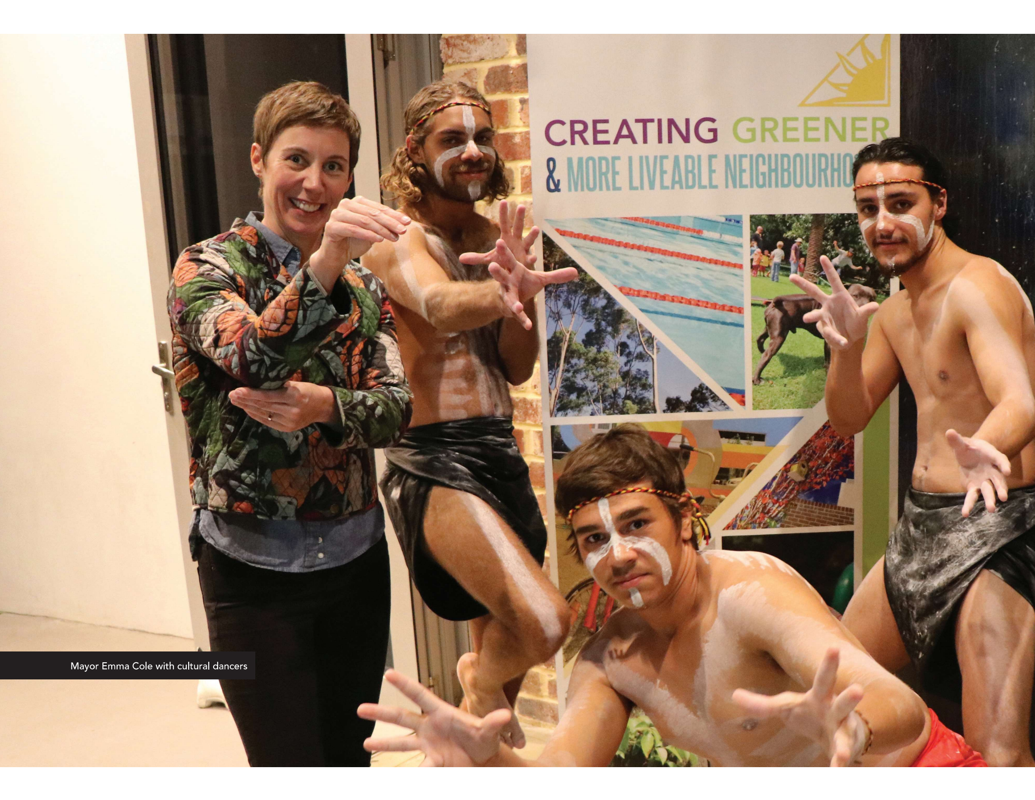
Mayor Emma Cole with cultural dancers