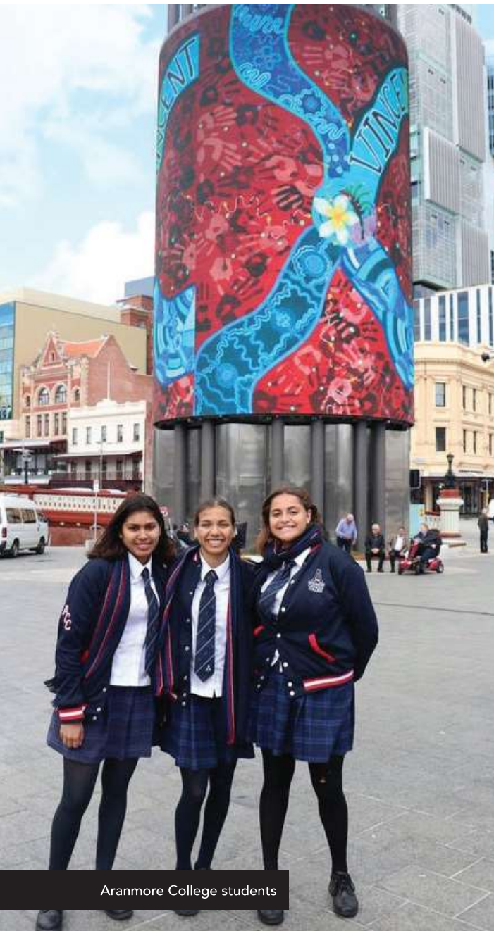
Aranmore College students