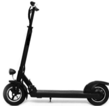
Figure 1: Illustration of a typical e-scooter

E-scooters are also available to purchase for private use across Australia. Suppliers sell e-scooters with a disclaimer for users to consult the relevant legislation regarding operation.