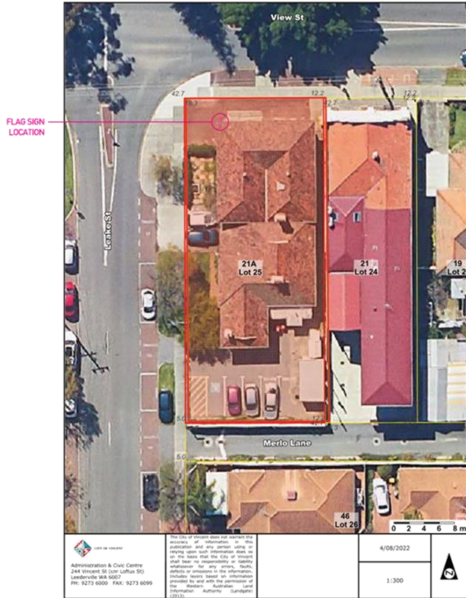
1:300 @ A2