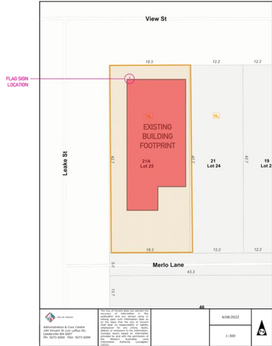
1:300 @ A2