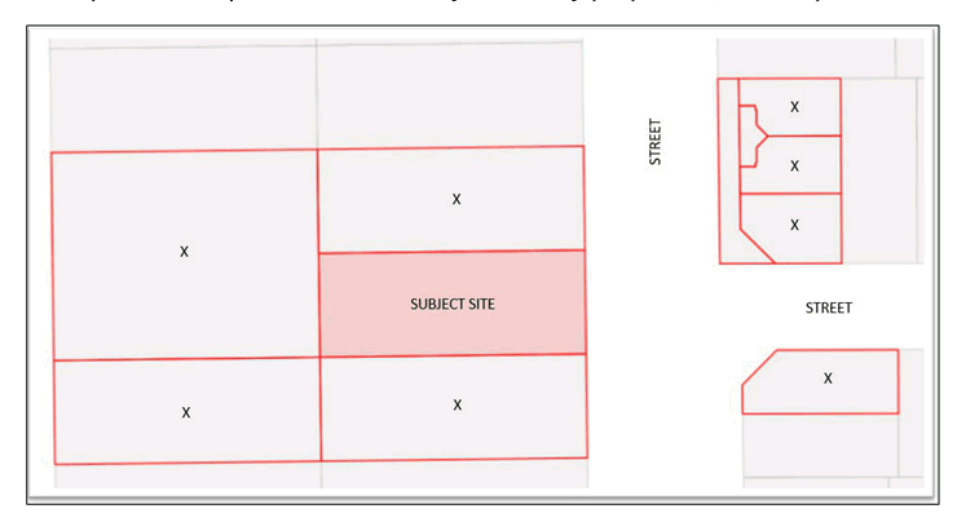
Figure 1 – Example of the extent of consultation to adjacent properties where there are varying lot layouts.