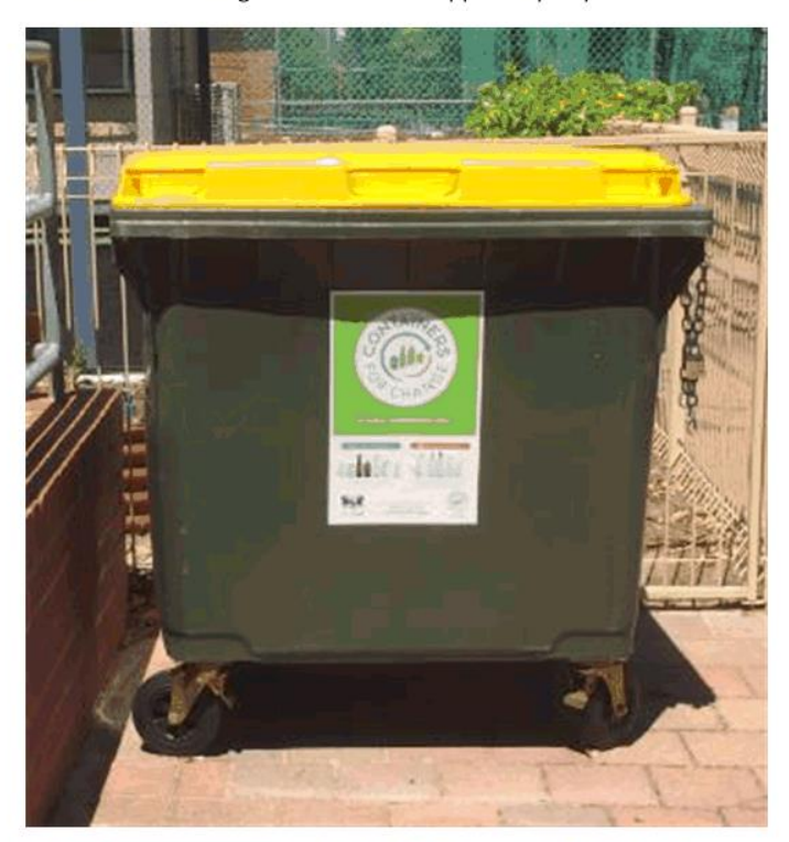
Containers for Change Collection Bin Supplied by City of Perth