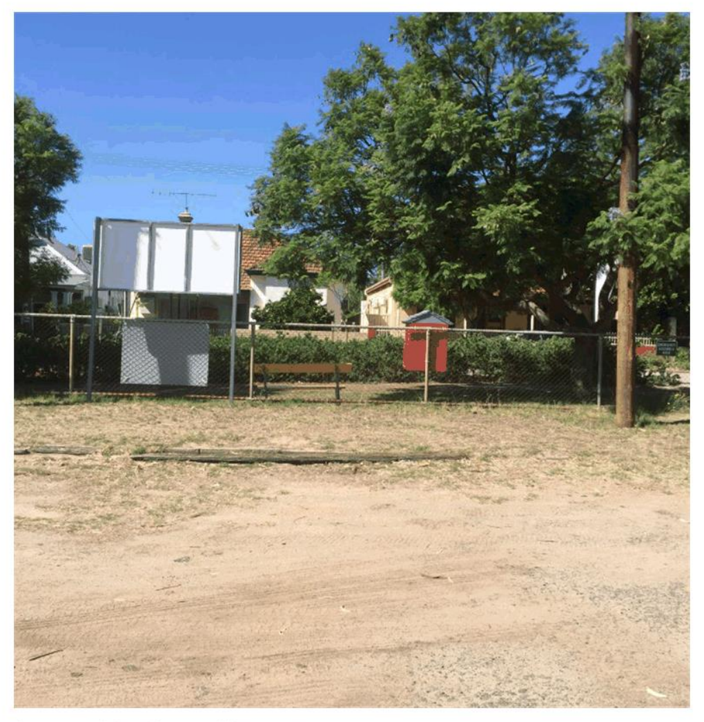
Fig. 2 Ground view of proposed licence area.