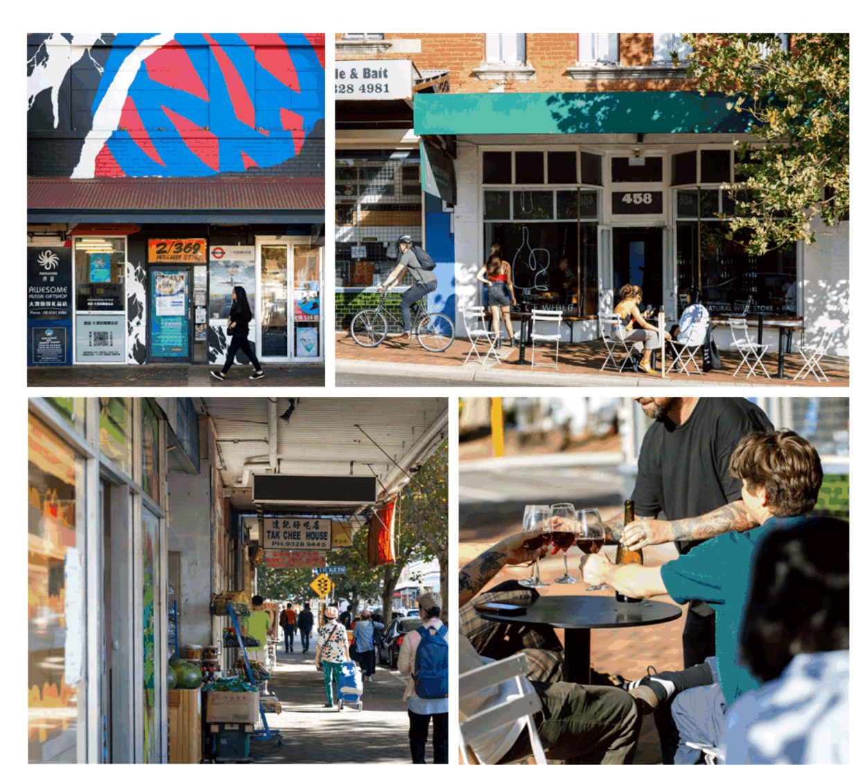
WILLIAM STREET TOWN CENTRE, PHOTOGRAPHY BY JESSICA WYLD 2020