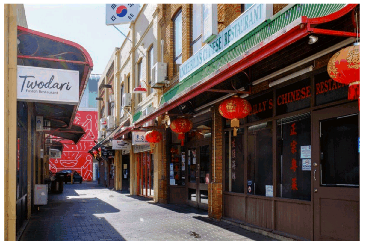
NORTHBRIDGE CHINATOWN, PHOTOGRAPH BY LYNN GAIL 2020

In the post-war period, the flow of new migrants increased dramatically with businesses and lodging houses servicing a growing number of post-war arrivals from Europe. From the 1970s onwards, increasing numbers of immigrants from Asian countries also established businesses in the area. The arrival of Vietnamese refugees in the 1970s, followed by migrants from Thailand, Lebanon, India, Malaysia and Turkey saw a shift in the cultural mix of the Northbridge area from 'Little Italy' as it had become known in the post-war period, to a broader cultural mix.