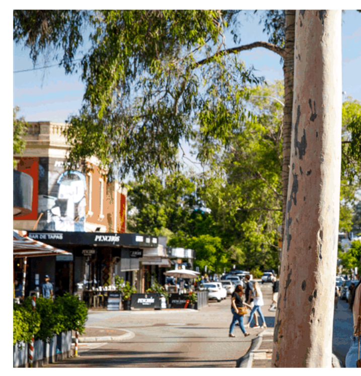
LEEDERVILLE TOWN CENTRE, PHOTOGRAPH BY JESSICA WYLD 2020