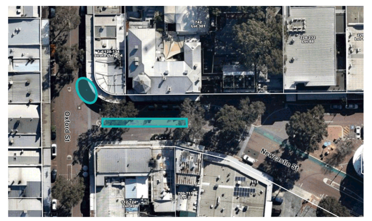
ARTWORK LOCATION SITE PLAN