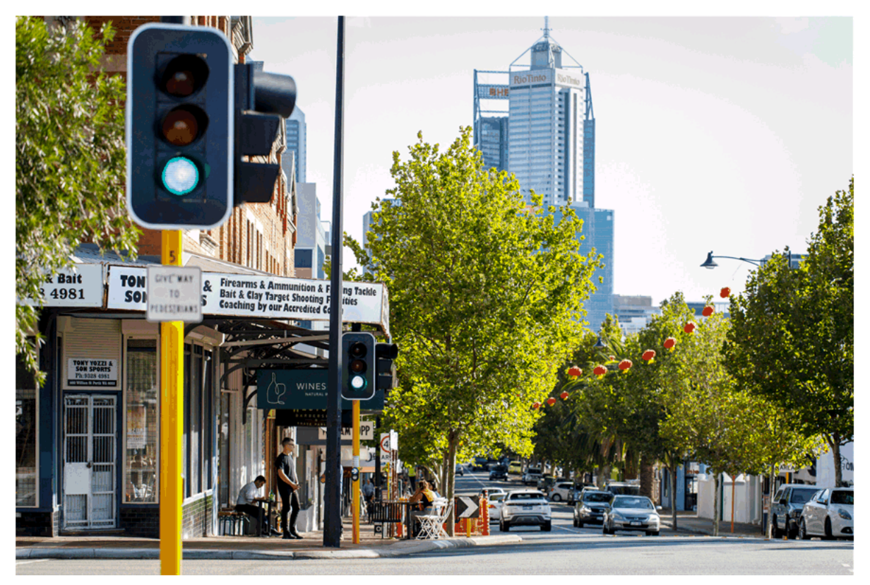
WILLIAM STREET TOWN CENTRE

Applications will be assessed by an Assessment Panel made up of Arts Advisory Group members, Administration, Town Team representatives and arts industry experts.