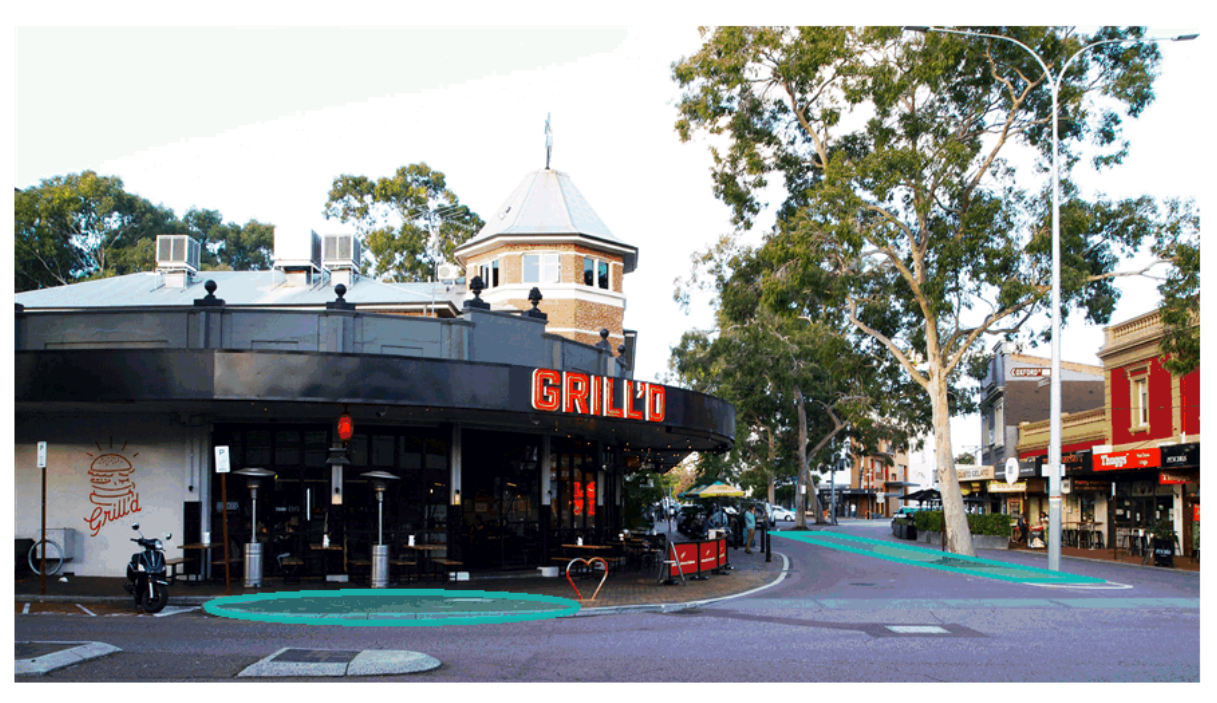
OXFORD STREET AND NEWCASTLE STREET INTERSECTION FACING EAST

The second location is the median strip, highlighted in the plan above. With the median strip now at street level there has been a recurrence of cars parking here, which is unsafe. This is an opportunity for applicants to design a sculptural work that deters parking on the median strip, whilst still allowing easy movement of pedestrians and cyclists. Lighting should also be considered to ensure a night time presence as well as day.