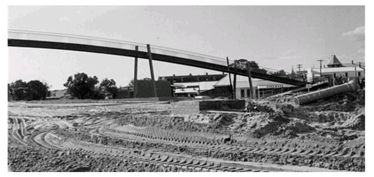
Construction of the Mitchell Freeway Leederville, 1974