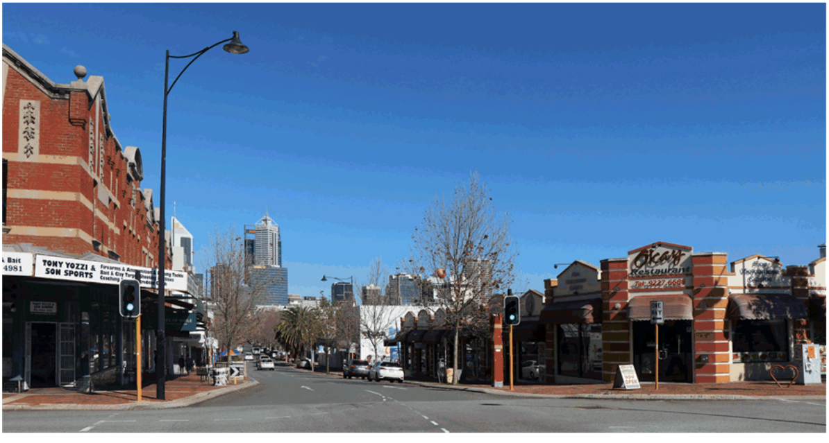
VIEW OF THE WILLIAM STREET AND BRISBANE STREET INTERSECTION FACING SOUTH

Located at the northern boundary of the main retail and culinary centre of Northbridge, this public artwork will be a statement of its place and will become synonymous with the town centre.