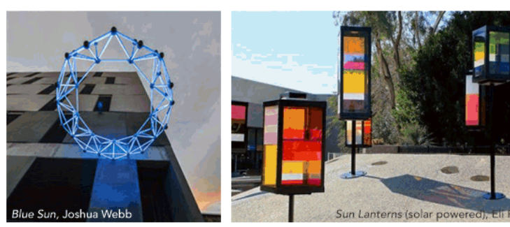
EXAMPLES OF PUBLIC ART FOR INSPIRATION