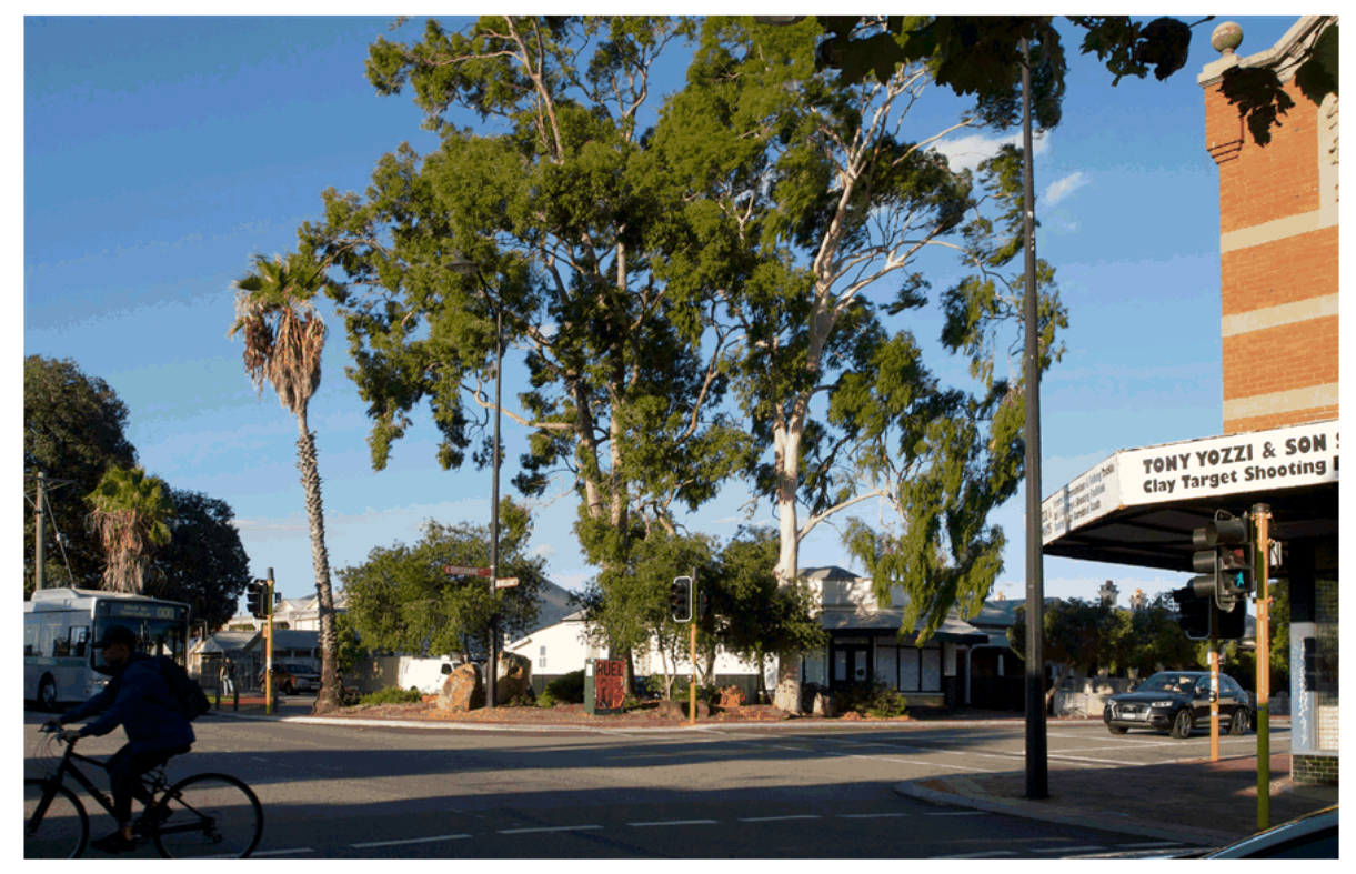
VIEW OF THE WILLIAM STREET AND BRISBANE STREET INTERSECTION FACING EAST