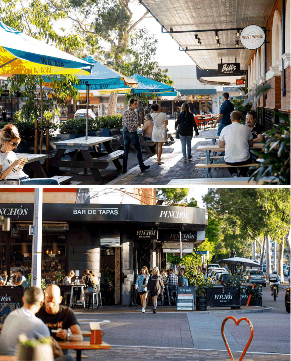
LEEDERVILLE TOWN CENTRE, PHOTOGRAPHY BY JESSICA WYLD 2020