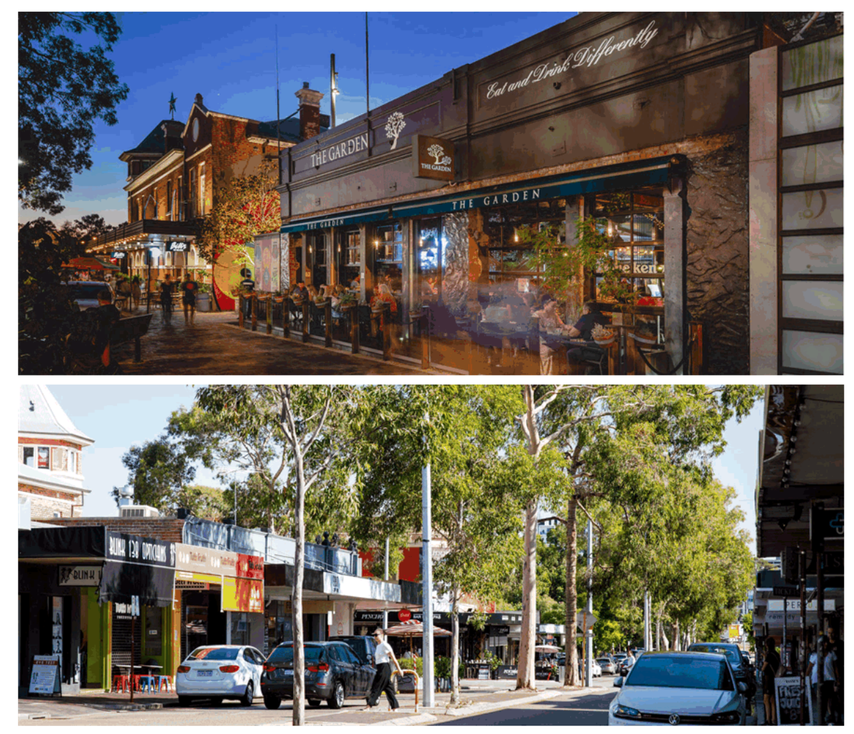
LEEDERVILLE TOWN CENTRE, PHOTOGRAPHY BY JESSICA WYLD 2020