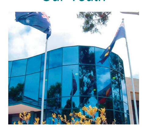
Our Built Environment