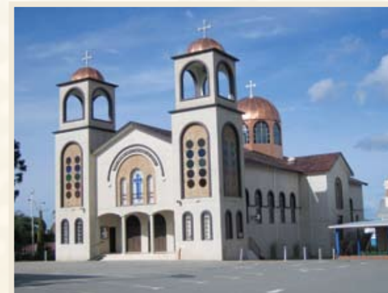
Greek Orthodox Church of Evangelismos 59 Carr Street