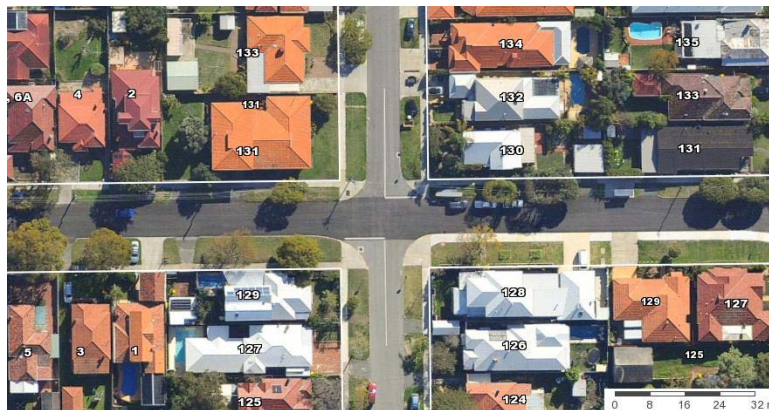
1. Aerial view of Tasman and Federation Streets intersection.

As can be seen from the aerial and site photographs below the same already existed in Federation Street on approach to Tasman Street.