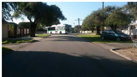
Transperth bus turning into Egina Street from Tasman Street.