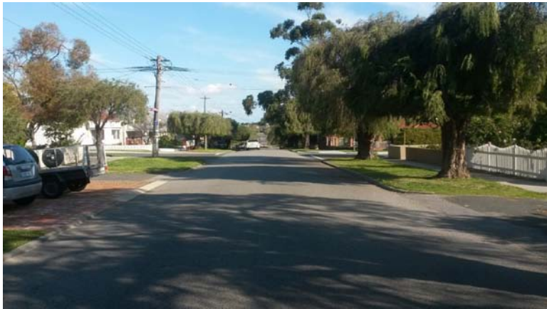
5. Egina Street south towards Tasman Street.

Therefore it is proposed to install yellow 'No Stopping' line-marking and stenciling at both intersections as currently common sense does not always apply, i.e. motorist parking too close to the intersection.