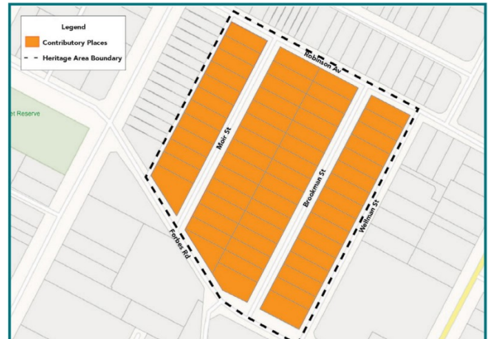
Figure 1: Map of Brookman and Moir Streets Heritage Area

Due to the significance of the BMHA, most works to houses require approval from the City.