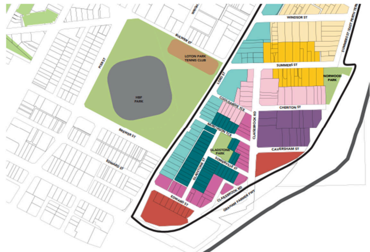
Figure 2 – Building Height Extract from North Claisebrook Planning Framework

1 Maximum height is achieved through Clause 4.7 Development Incentives for Community Benefit.