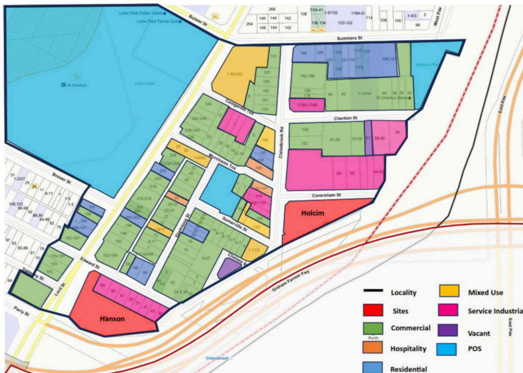
Figure 1 – Current Land Use Activities within Locality

There are also two areas of public open space within the locality including Gladstone Street Reserve which is located centrally, and Norwood Park which is in the north-eastern corner.